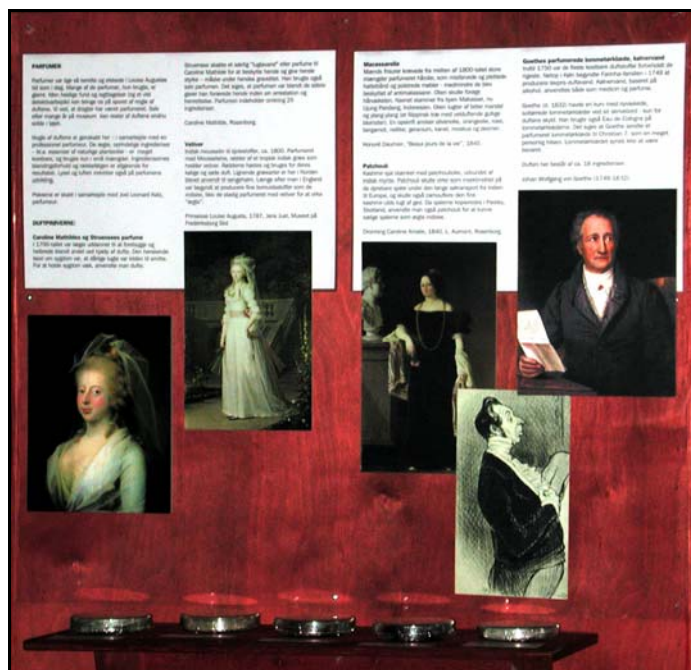
Figure 8. Samples of perfumed historical textiles appeal to museum guests. They find it a compelling and uniquely private experience – a valuable asset for museums which are competing with mass communication and popular entertainment. Reconstructed scents of historical perfumes have been presented at several costume exhibitions at the Royal Danish Collections and the response has been overwhelmingly positive.

Once the components of a historic textile's scent have been identified, the question is naturally whether to try to revive or recreate it. Fixatives are always used to increase, intensify or prolong the odor of perfumes. In principal, reapplying a fixative to a perfumed object might indeed revive the remnants of the original scent. However, this cannot be recommended because we cannot be certain the result is correct, nor can we predict what effect such a treatment might have on aged and perhaps deteriorating objects. But if the original ingredients of a scent have been identified, there is no reason why the scent can not be recreated separately and presented as a suggestion of how the object might originally have smelled. Using the original fixative creates a long-lasting scent on a modern, suitably neutral material.