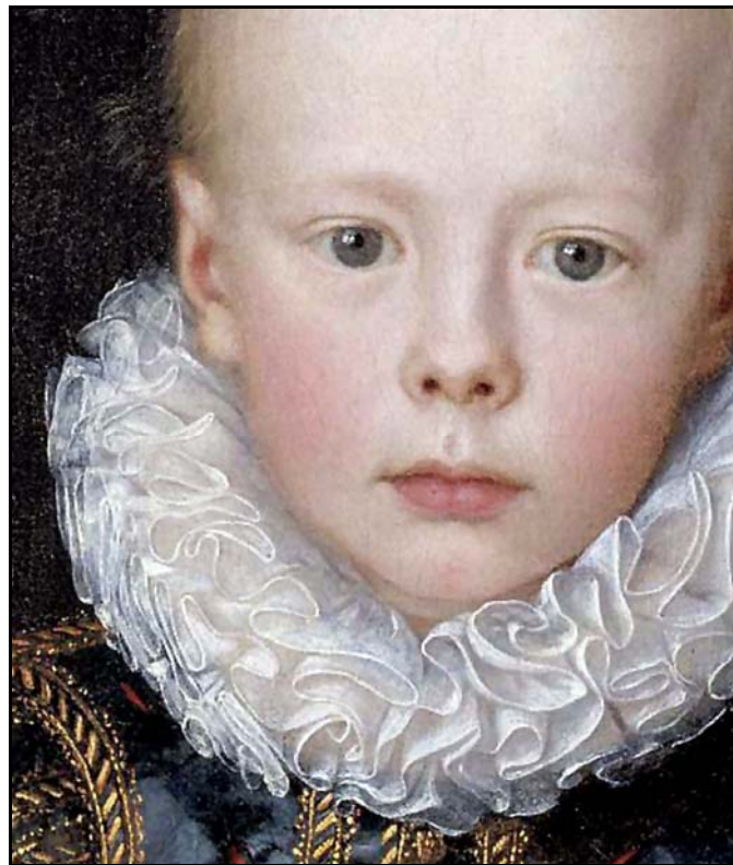
Figure 3. In the early 1600's fine linen ruffs were laundered in lavender water, ironed, piped, and stiffened with perfumed and sometimes tinted starch. In storage, they were sprinkled with powdered orris root and wrapped in linen covers. Portrait of a Danish Prince ca 1615 (detail). Nivaagaard Portrait Collection, Denmark.

chimneys of the Rosenborg Castle that workers were allowed to scrape it out as part of their pay), perfumed wood inlays in furniture, fragrant powder for wigs and makeup, lacquers, pomades and lotions, and much more. An elaborately embroidered pillow from around 1700, perhaps actually a muff, contains rose petals, bitter orange peel, cloves, marjoram, storax calamita, lignum rhodii and tea leaves, both for fragrance and perhaps for medicinal properties. It is reported that Goethe sent a perfumed handkerchief to King Christian VII, though it does not seem to have been preserved. The Danish royalty's horses' tackle was perfumed in the 1800's with cloves and lavender. The original small gold containers with a few drops of the anointing oils used at coronations in 1700 and 1840 still exist: the kings were given a choice beforehand of several different scents. The kings' interest in cultivating suitable roses, herbs and other materials used for perfuming can be traced through the history of the royal gardens.