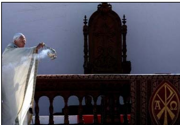
Figure 1. The word perfume comes from (Fr.) per fumar meaning pleasant-smelling or literally, from the smoke: the oldest way of imparting a smell. Fragrances were once considered to be the souls of objects, and thus spiritual and sacred in themselves. Incense is used in religious ceremonies all over the world, and its fragrance is often noticeable on church vestments. Pope Benedict XVI blesses the altar on his visit to Brazil, May 2007.

Smells are for us clearly culturally rather than physiologically defined. One system of categories assigns seven basic qualities to smells: ethereal, prickly, floral, minty, camphor, musk, and rotten, although other systems include such elements as garlic-like, aromatic, burnt, animal, and billy-goat.