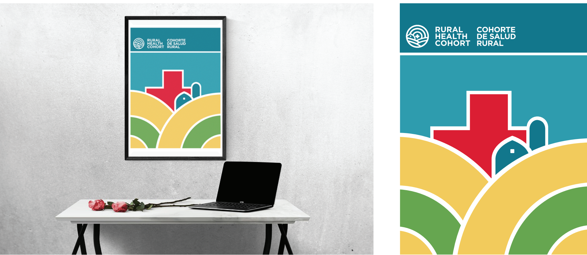
Poster/ Conceptual T-Shirt Design

The RHC is a five-year study of substance use in the Midwest. In this program they will use peer-based recruitment to help grown and maintain the cohort over a five-year period. Though the use of mobile technology developed by the LNC (Open Dynamic Interaction Network cellphone software) and confidential questioning regarding attitudes, emotions, activities, locations, and relationships they hope to gain an understanding of substance use in the Midwest.