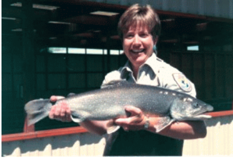
Hatchery employee holding a broodstock lake trout