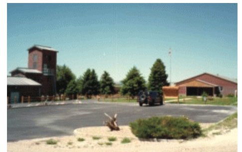
Saratoga National Fish Hatchery

As a result of the Saratoga NFH broodstock program, genetically distinct strains of trout have been perpetuated, and the eggs provided to production hatcheries contribute to the multi-million dollar economic impact of recreational fishing throughout the Nation. Excess and retired brood fish are also stocked in Wyoming waters to support additional recreational angling opportunities.