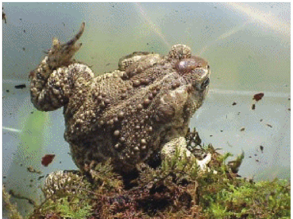
The endangered Wyoming toad is being reared at Saratoga National Fish Hatchery

Saratoga NFH is located 4 miles northeast of Saratoga, Wyoming, on 120 acres of land. Join the hatchery staff as they participate in local public fishing festivities for National Fishing and Boating Day events in June. Come prepared for a day of fun!