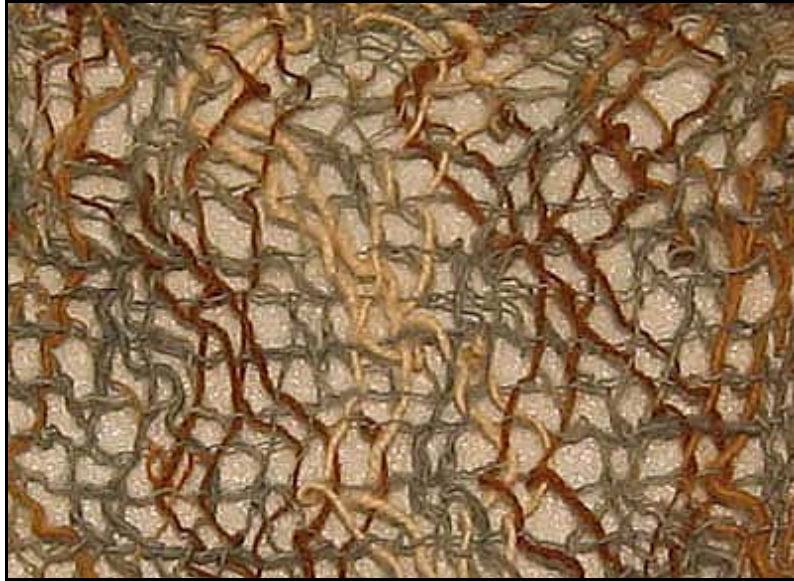
Figure 2. Detail of Chancay gauze headdress.

A combination of gauze techniques was used in the creation of the Carlos Museum piece (Fig. 2). The first is a simple alternating gauze weave with directional change occurs every eight wefts. In these sections, each warp is pulled under two adjacent warps and held in place with a single weft. In between directional shifts, the structure is that of an alternating gauze weave (without direction change), which allows the warps to create the long diagonals necessary for making the serpentine zigzag. The serpentine figures stand out against the blue background, but from further away, the polychromy and knobby texture of the cloth give it a speckled appearance.