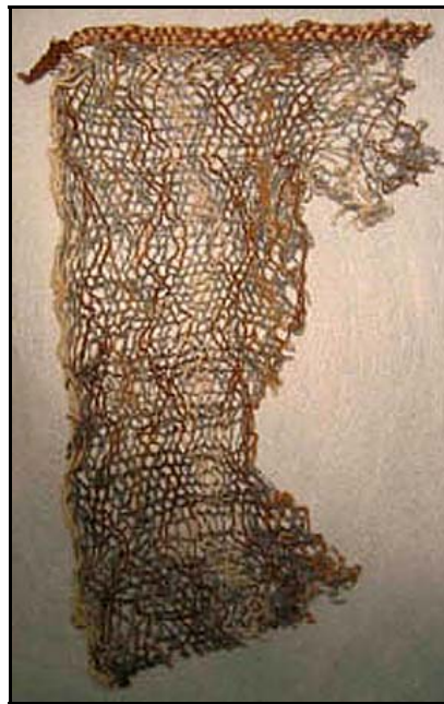
Figure 1. Chancay gauze headdress. 8 3 / 4 " x 5 1 / 2 ".

A small but fascinating Chancay gauze fragment in the collection of the Michael C. Carlos Museum stands out as an exemplary object that embodies the symbolic associations and aesthetic principles of the Peruvian coastline during the Late Intermediate Period (Fig. 1). 1 Its weave structure, production process, iconography, and polychromy unite in reinforcing the protective and regenerative purposes of the original headdress. Consisting of variably spun threads knotted together, its unique discontinuous warp relates to its function in funerary and ceremonial contexts. Significantly, its weaver pushed beyond technical limitations to bring together the laborious techniques of gauze weaving and discontinuous warping in a single textile. 2 The result of this ingenious yet unpublished technical combination was a “jumping” serpentine figure on an indigo background. The allusion to serpent movement, enabled by the use of a discontinuous warp made whole through the tying of tiny knots, recalls both the corporeal process of the cloth’s creation as well as the physical exertion of snakes. Moreover, the cloth’s overall polychrome patterning evokes the vivid dorsal patterning of snakes that have just shed their skin and emerged headfirst into the environment as regenerated beings.