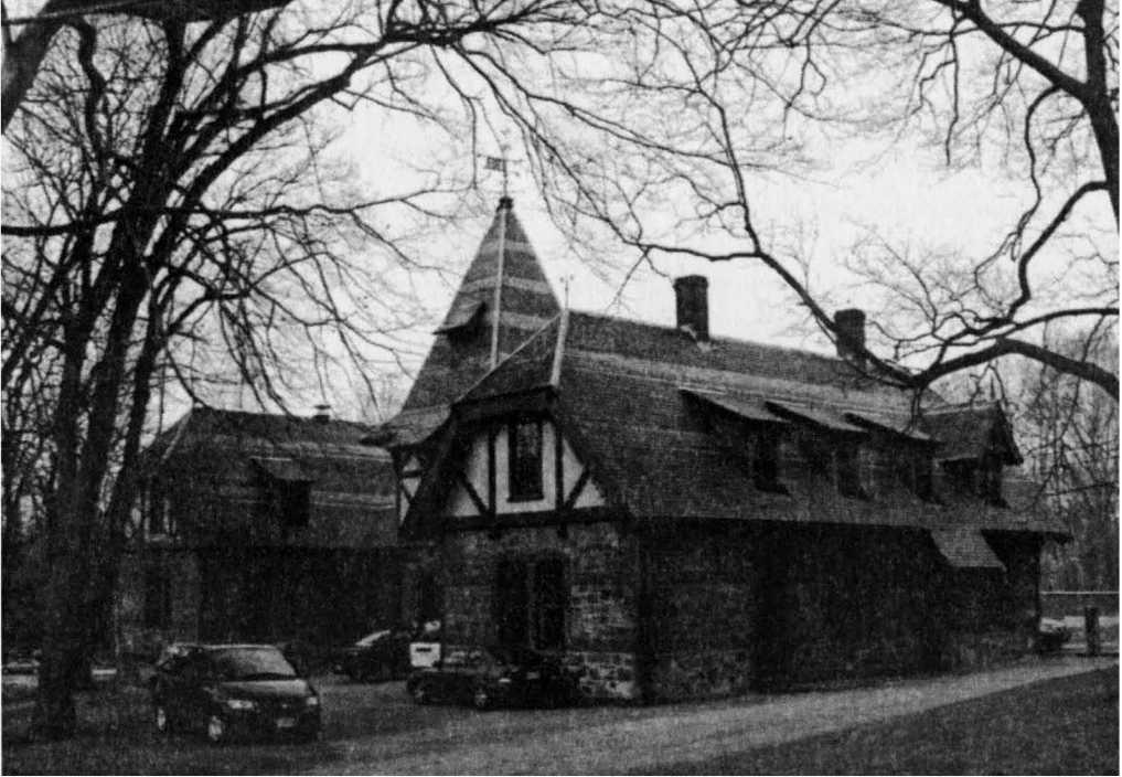
Adams National Historical Site, Quincy, Massachusetts Carriage House is pictured above