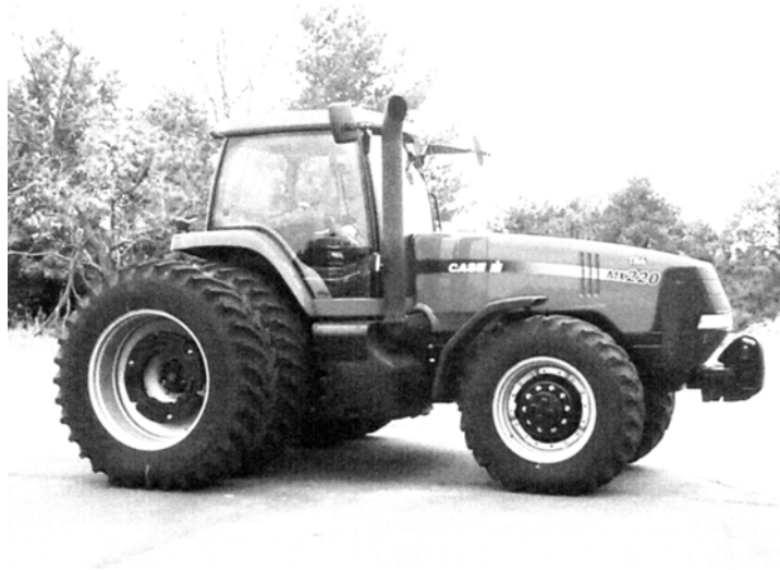
CASE IH MX 220 DIESEL