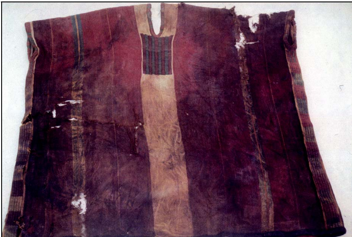
Figure 7. Alto Ramirez-style man's tunic from the late Caserones cemetery TR-40B Tomb 3. Collection Museo Antropologico Arturo Prat, Iquique.

What happened to this woman's garment, an essential element of dress from the earliest periods of coastal Chilean prehistory? Cassman's (this volume) discussion of twined mats originating with the Chinchorro shows that some textile traditions have endured to the present day in northern Chile. But this is not the case with the woman's string skirt that disappears from the archaeological record following the end of the Formative period. Investigators generally agree that the end of the Formative occurs when the highland oriented Alto Ramirez (Rivera 1991) bring new cultural traits such as intensive agriculture onto the Chilean coast. Perhaps as early as the first centuries A.D. it appears that the highland-style woven tunic replaced loincloths and string skirts as the only garment form for both men and women. At Caserones the later cemetery (TR-40B) contained only tunics in burials of men and women. Some Caserones' shirts from this late cemetery show a remarkable connection with the cultural group known as Alto Ramirez from northern Chile near Arica (Fig. 7) and the abundance of agricultural products like maize, popcorn, quinoa, and beans in this late Caserones' cemetery emphasizes the highland connections of these Alto Ramirez people.