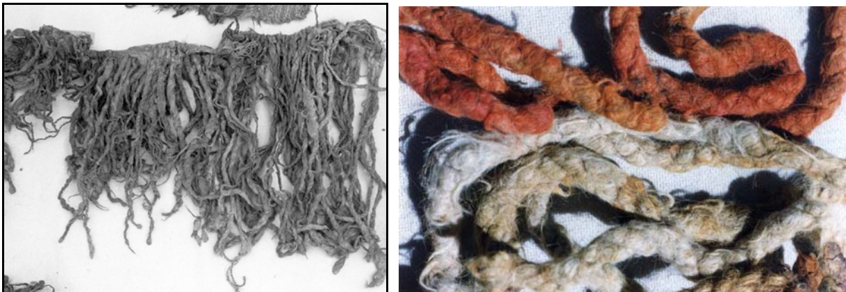
Figure 5 (left). String skirt from TR-40A, Tomb 90 S-M'. Collection Museo Antropologico Arturo Prat, Iquique. Figure 6 (right). Detail of string skirt from TR-40A with very thick (2.5 cm) replied cords in natural white and red-dyed camelid fiber. Collection Museo Antropologico Arturo Prat, Iquique.

Tomb 90, an early burial inside a very large, finely coiled basket was associated with a woman wearing a thick string skirt like at least 18 other burials at Caserones (Fig. 5). True and Nunez (1972) indicated that string skirts were a woman's garment "found on adult females in the Tarapaca cemetery". String skirts were paired with twined mantels in seven Caserones early burials and noted alone in seven additional tombs. Twined mantels (70 x 100 cm) were created with spaced wefts of soft plied camelid-fiber yarns spun in the S direction and plied Z. Twining yarns are very fine and worked in widely spaced rows in the Z direction (Rodman 2000:Figures 12.11 and 12.12). The skirts, approx. 30-50 cm. in length, were created of very thick (1.5-2.5 cm) replied camelid fiber cord with a matted, dense texture (Fig. 6).