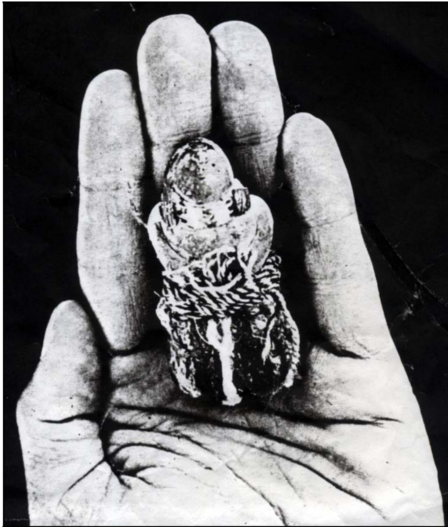
Figure 8. Miniature clay figurine wearing a miniature string skirt from TR-40A, Tomb 88.

Formative people must have contrasted enormously with highland groups as they interacted with one another along the Chilean coast and inland desert communities such as Caserones. Alto Ramirez men wore brilliantly dyed red and blue warp-striped shirts with thick embroidery along the sides and below the neck area. Coastal Formative people wore very little; string turbans and simple loincloths. Women wrapped string skirts around their waist like the one discovered covering a miniature figurine excavated in the early Caserones cemetery TR-40A (Fig. 8).