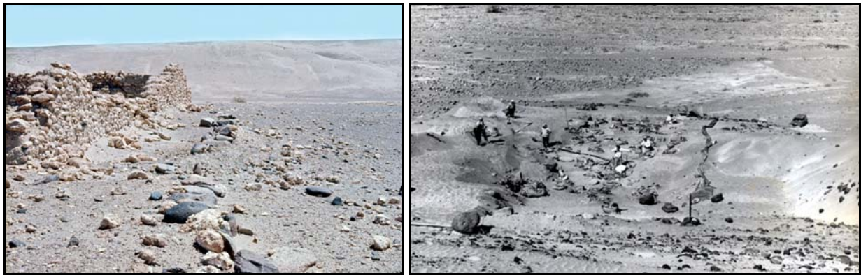
Figure 3 (left). Standing walls and wall rubble at the site of Caserones. Photograph by Delbert True, 1967.

In plan the Caserones site does not look like other early villages with its double defense wall surrounding rectangular houses and True and Nunez and others remained ambivalent with respect to Caserones' ultimate identity discussing the site first with coastal antecedents connected to the Faldas del Morro tradition (Nunez 1969; True and Nunez 1972), but later as a highland village in northern Chile with altiplano connections (Munoz 1989:119; Rivera 1991:21). Obviously, the standing walls represent the last permanent Caserones occupation before the site was abandoned around A.D. 700, but it is possible that original circular structures were altered through successive site rebuilding and reoccupation (True 1980:149). No water runs in front of the Caserones ruins today and photographs from Delbert True's original excavations illustrate how dry the region is where he found discarded baskets and fallen construction material left on the site's surface (Fig. 3).