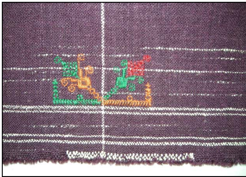
Figure 1 (right). Woman's rebozo from Salasaca, Ecuador, collected in 1966.