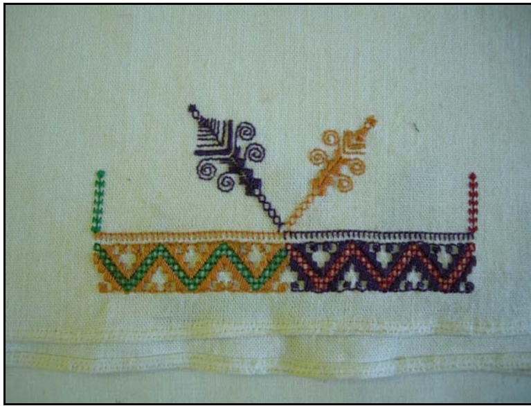
Figure 3. Detail of men's festival pants from Salasaca, collected in 1966. Cotton. The Textile Museum, Washington, DC 2001.2.1, Gift of Bernard Fiskén.

Women's shawls in Salasaca are worn in the indigenous way, however, which probably is of Inca origin. The rebozo is folded in half, draped over the back and both shoulders, and pinned on the chest. 3 There is considerable inconsistency in the terminology used for different garments in highland Ecuador, and the fact that the Salasaca rebozo is significantly longer than it is wide is the main thing that connects it to other shawls that are called rebozo elsewhere in the Americas, which are normally worn without being pinned, a style that seems to have come into use during the seventeenth century in Mexico.