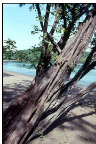
Figure 5. “ Haematoxylon brasiletto .” Costa Rica.

This small tree grows in tropical and sub tropical areas of the Continent. The pulp that covers the seeds contains bixin, norbixin, and six other colorants of the carotenoid family, as well as tannins 17 . The orange-red paste obtained from huantura seeds was used to paint face and body, as well as for food flavouring. However, bibliographical information of its use as a dye is very scarce. Only Bernabé Cobo, in 1653 makes an eloquent observation about its dyeing properties: This colour is so firm, that even with soap and lye it is impossible to clean the cloth dyed with it 18 . Cobo’s remark seems exaggerated, so perhaps he just refers to stained cloth, not dyed on purpose. Anyhow it indicates its possible use as a dye in America, maybe not for its fastness but because of its beauty. Such was the reason of its great success among silk European dyers in the XVIII century 19 .