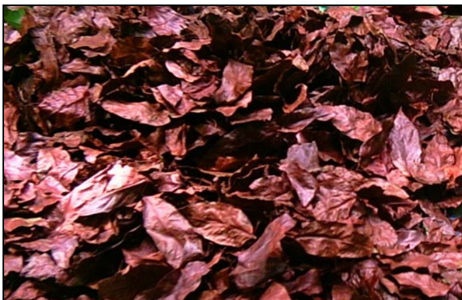
Figure 4. “ Arrabidaea chica .” Colombia.

Investigation and analysis by HPLC-PDA carried on by Devia 14 et al. on textiles from the tenth to the sixteenth centuries, belonging to Muisca, Guane and U’wa civilisations from Colombia, revealed the recurrent presence of this red dye in textiles of the area. The main dye constituent of Arrabidaea , carajurin, was established by Chapman et al. in 1927, for which they proposed a 3-desoxyanthocyanidin structure. Recent research by Devia et al. has confirmed the structure proposed by Chapman for carajurin, and have isolated and determined the structure of two new 3-desoxyanthocyanidins from the leaves, all of which produce fairly stable red dyes 15 .