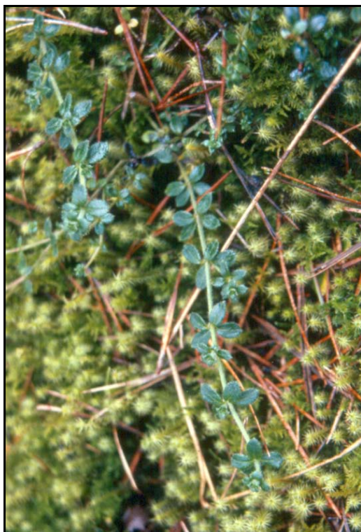
Figure 3. “ Relbunium ” sp. Cotopaxi, Ecuador.

A strong red, slightly orange, is produced by the roots of several herbs of the Relbunium and Galium genus from the Rubiaceae family. These grow in tropical forests of the Continent at medium and high altitudes, between 900 and 3000 m. The colorants they contain belong to the anthraquinone group and therefore provide very fast colours. Bernabé Cobo, in 1653, described chapi-chapi , as a small plant which produces short slender stems that lie on the ground; with many little leaves... and indicates that the natives use them to dye the red woollen cloth 10 .