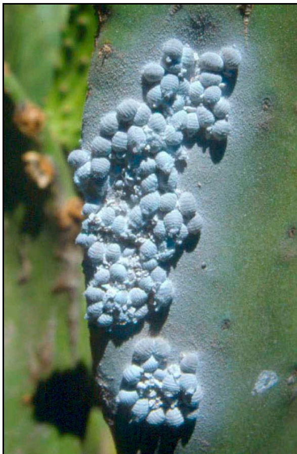
Figure 1. Cochineal (Dactylopius coccus), Mexico.

food: ...we order that in the entire kingdom there must be food in abundance... and magno... and other kinds of leaves to dye colours for cumbi... 4 .