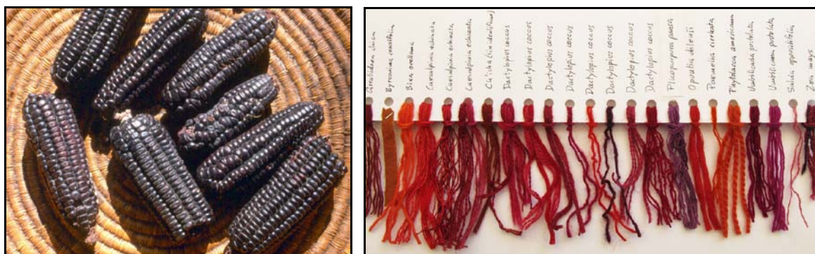
Figure 8 (left). Purple corn, “ Zea mays .” Peru.