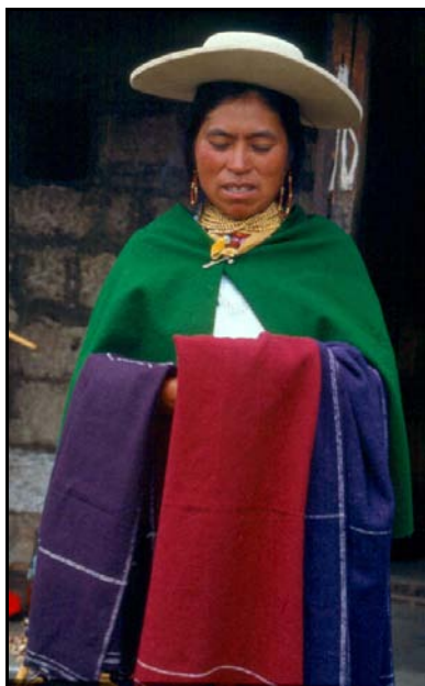
Figure 2. Salasaca dyer showing red woollen cloths with modified cochineal red colours. Ecuador.

vara y media in reference to the length of the cloth 6 . It was traditionally dyed with cochineal 7 but each woman would choose a different shade of red.