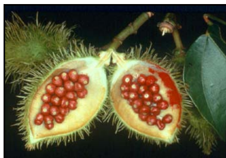
Figure 6. “ Bixa orellana .” Peru.

This small tree grows in tropical and sub tropical areas of the Continent. The pulp that covers the seeds contains bixin, norbixin, and six other colorants of the carotenoid family, as well as tannins 17 . The orange-red paste obtained from huantura seeds was used to paint face and body, as well as for food flavouring. However, bibliographical information of its use as a dye is very scarce. Only Bernabé Cobo, in 1653 makes an eloquent observation about its dyeing properties: This colour is so firm, that even with soap and lye it is impossible to clean the cloth dyed with it 18 . Cobo’s remark seems exaggerated, so perhaps he just refers to stained cloth, not dyed on purpose. Anyhow it indicates its possible use as a dye in America, maybe not for its fastness but because of its beauty. Such was the reason of its great success among silk European dyers in the XVIII century 19 .