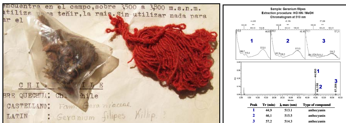
Figure 10 (left). “ Geranium filipes ” sample.

Three compounds were detected as main components in the Geranium filipes sample. As shown in Figure 10, the UV-visible absorption properties ( \lambda_{\text{max}} ) are similar for the three and typical for anthocyanin dyes.