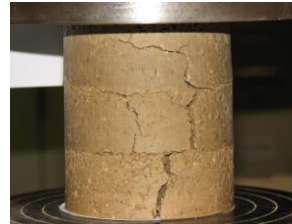
Figure 4. Failure pattern typical of brittle specimens.

Atterberg Limits (LL, PL, PI), percent retained on the #200 sieve, Maximum Dry Density and Optimum Moisture Content, and Unconfined Compression ( q_u ) tests were performed in order to evaluate the mechanical properties. These tests were performed on all soil mixture combinations proposed in this research and are provided in Table 4. It is observed that the addition of the 3% waste RCC had a minimal effect the LL, PL, and PI, Maximum Dry Density and Optimum Moisture content for all the soil types except for the High PI soils where the Optimum Moisture decreased 1 to 2 percentage points. When lime was added the LL, PL, and PI, and Maximum Dry Density and Optimum Moisture content results changed as would be expected. When evaluating the unconfined compressive strength ( q_u ) results with the addition of RCC and compared to the original soil, the key findings were found as follows.