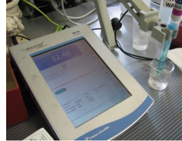
Figure 2. PH Level Testing