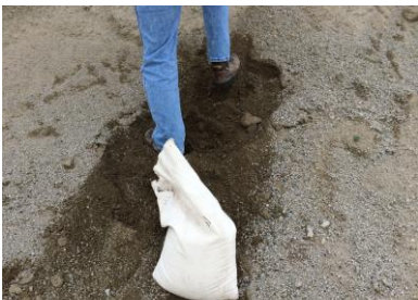
Hwy 75 Waste RCC