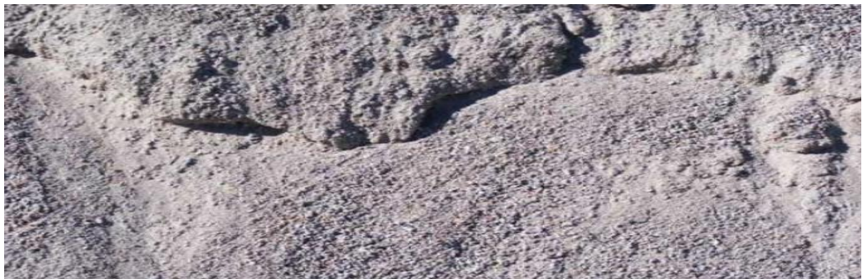
Figure 5. Recycled Crushed - Concrete Fines

The results show that the compressive strength of the soil with 3% RCC waste material did not cause a detrimental effect to soil modification. Figure 5. shows a typical stockpile of RCC fines produced from crushing operations. The Department of Roads has limited the amount of fines to be used as base course, due to potential drainage problems. When the concrete to be crushed is severely deteriorated the amount of concrete fines could be high; this may cause the Contractor to haul concrete fines to a landfill for disposal.