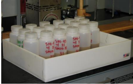
Figure 1. PH Level Soil Samples

Part of the study consisted of evaluating the virgin soil chemical PH level for each soil type, with the addition of the 3% waste RCC material, and with lime and with waste RCC material. The soil pH was tested in accordance with ASTM C 977. Different percentages of lime were added to the soil in order to reach a pH soil level of 12.40 to stabilize the soil. The testing for pH levels is used to determine the percent lime that is required for the soil type; in order, to increase the unconfined compressive strength and decrease plastic index. The following Table 3 shows the results of the materials tested.