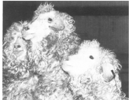
Figure 1. High prices for mohair have stimulated interest in Angora goat production.

Both male and female goats are seasonal breeders. The male commences rutting in the fall and is largely responsible for initiating estrus in the does. Well-grown-out doe kids reach puberty at 6 to 8 months, but usually fewer than 50 percent conceive. Hair production is reduced if does kid their first year.