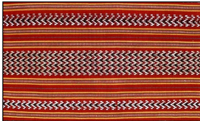
Figure 1. Detail of a strip of cloth featuring the tu muk motif. Woven in 2007. [MH]

Decorative sashes and other narrow strips of cloth are woven on a long and narrow type of frame loom that will be described in detail below. This loom appears to be been designed to weave a variety of supplementary warp and supplementary weft motifs on relatively narrow bands of cloth. These bands can be used for decorative sashes, added to the edges or wider pieces of cloth for decoration, or stitched together to form wider pieces of cloth that are covered with decorations. In addition to a range of geometric patterns, there are also more realistic motifs. Complex motifs depicting Siva on top of a peacock and another of a dragon (see Howard 2005: 129, fig. 14) are woven only using the supplementary weft technique. A somewhat less graceful motif depicting a human figure is woven using the supplementary warp technique. Geometric figures are woven using both the supplementary weft and the supplementary warp motif. The gal vak is an especially popular geometric motif woven using