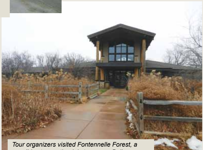
Tour organizers visited Fontennelle Forest, a possible stop on the July tour, near Bellevue.