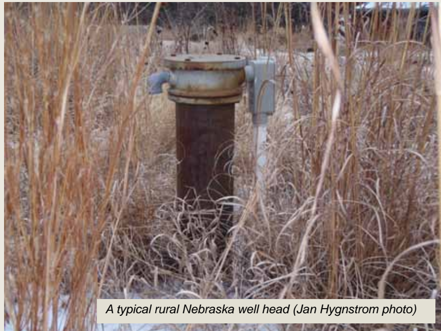
A typical rural Nebraska well head

Potential contaminants in household wastewater include disease-causing bacteria, infectious viruses, household chemicals and excess nutrients, such as nitrate. The NebGuide “Protecting Private Drinking Water Supplies: Wastewater (Sewage) Treatment System Management” will help evaluate the type of onsite wastewater treatment system in use, return of treated wastewater to the