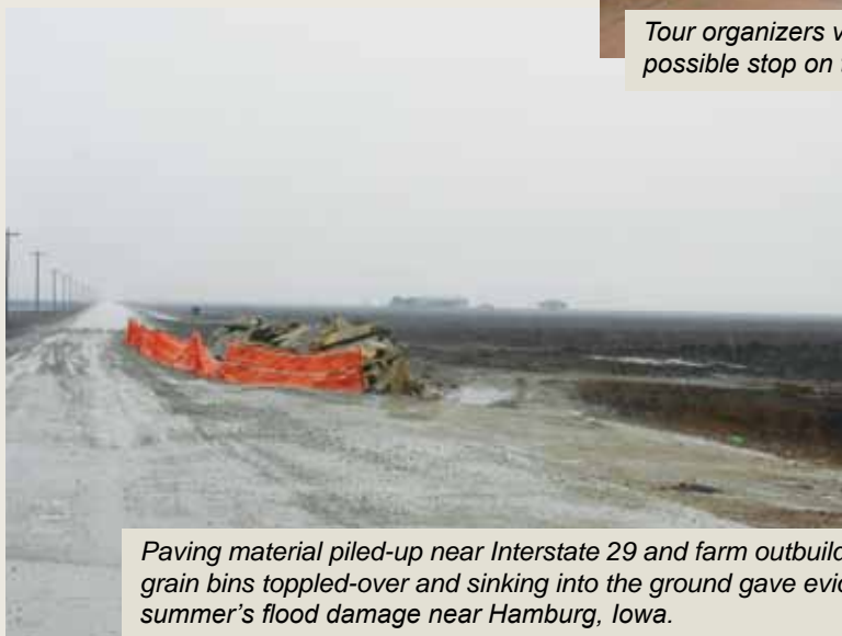
Paving material piled-up near Interstate 29 and farm outbuildings and grain bins toppled-over and sinking into the ground gave evidence to last summer's flood damage near Hamburg, Iowa.