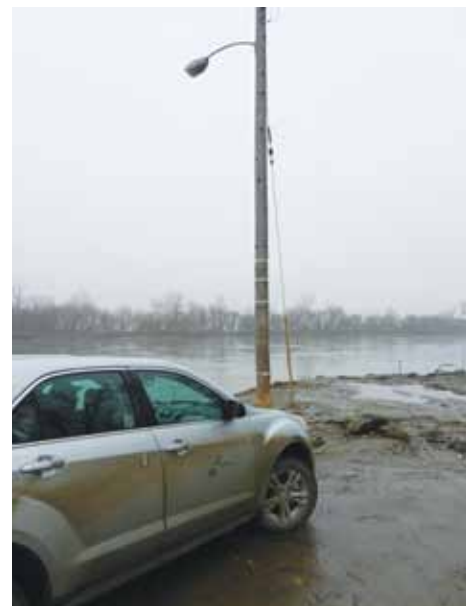
Metal bands on a light post near Peru show the height of flooding on the Missouri River in recent years. The highest band is from the summer 2011 flood. Recent flooding on the river is the subject of this summer’s water and natural resources tour.

In December, Ress, Jess, Jeff Buettner of Central Nebraska Public Power and