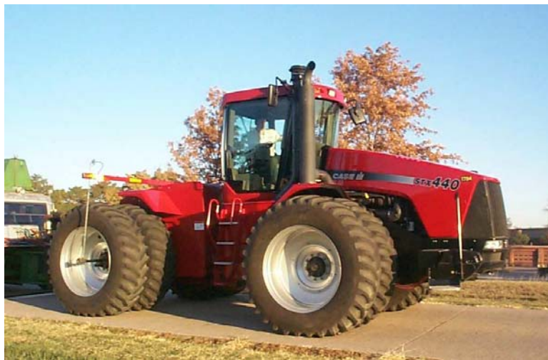
Case IH STX 440 Diesel