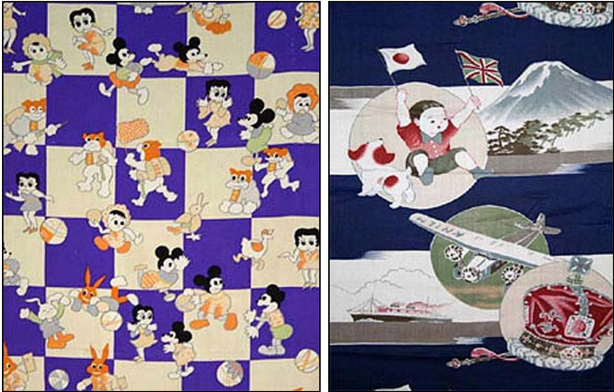
Figure 6 (left). Detail, American and Japanese cartoon characters (Betty Boop, Mickey and Minnie Mouse, Norakuta, etc.), printed silk, late 1920s. Collection of Michiko Okunishi, Osaka, Japan. Used with permission. Figure 7 (right). Detail, commemoration of coronation of King George VI, printed muslin, 1937. Collection of Michiko Okunishi, Osaka, Japan. Used with permission.

Film was also used as an icon of modernity and favorites for children's clothing were those designs that included both Western and Japanese popular cartoon characters (Fig. 6). Movie equipment also appeared in designs; one for a boy's kimono depicts film projectors surrounded by vignettes of military scenes of the kind likely to have been included in newsreels, thus neatly combining modernity and militarism. Important public figures and events, such as the 1937 coronation of King George VI in England (Fig. 7), that captured the popular imagination were equally of interest to designers and the public alike.