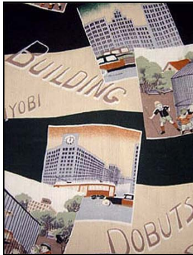
Figure 3. Detail, printed wool muslin, 1930s. Images show a zoo and examples of modern transportation and architecture. Collection of Michiko Okunishi, Osaka, Japan. Used with permission.

the past that were, for the most part, based on time-honored seasonal and literary motifs and themes. Rather, these new designs mirrored contemporary popular culture and offer us today a unique visual reference of the social, cultural, and even political interests and icons of the period. The designs, which were used primarily on traditionally printed textiles (muslin was a favorite for this, as it lent itself particularly well to western chemical dyes that were also new to Japan), as well as the newer meisen and niko-niko kasuri , were termed omoshirogara —that is, interesting and/or amusing designs or patterns, and were comparable to what in the West have been called “novelty” or “conversation” prints (Fig. 3). 3