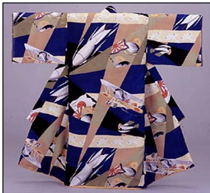
Figure 10. Boy's haregi, searchlights, airplanes, and bombs, printed silk, late 1930s. Collection of Yoku Tanaka, Tokyo, Japan. Used with permission.

The growing militarism of the 1920s and 1930s also found its way into omoshirogara, with child soldiers, bombers (see Fig. 10), battleships, and all types of military paraphernalia becoming increasing popular as design elements as war escalated through the 1930s. The material side of warfare, in textile design at least, was seen as exciting and reflective of Japan's modern power, rather than as potentially destructive and horrifying.