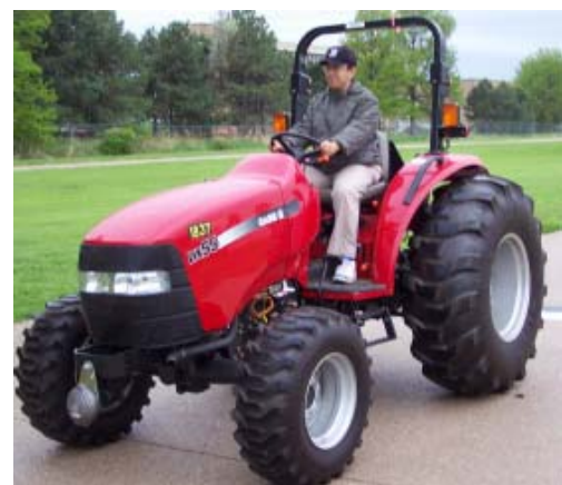
Case IH DX 55 Diesel