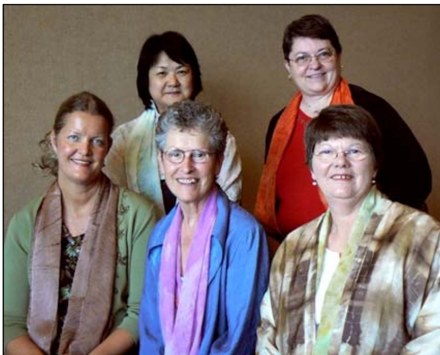
Figure 1. THE 'CANADA' NATURAL DYE CONNECTION

Karen Diadick Casselman, kldc@ns.sympatico.ca