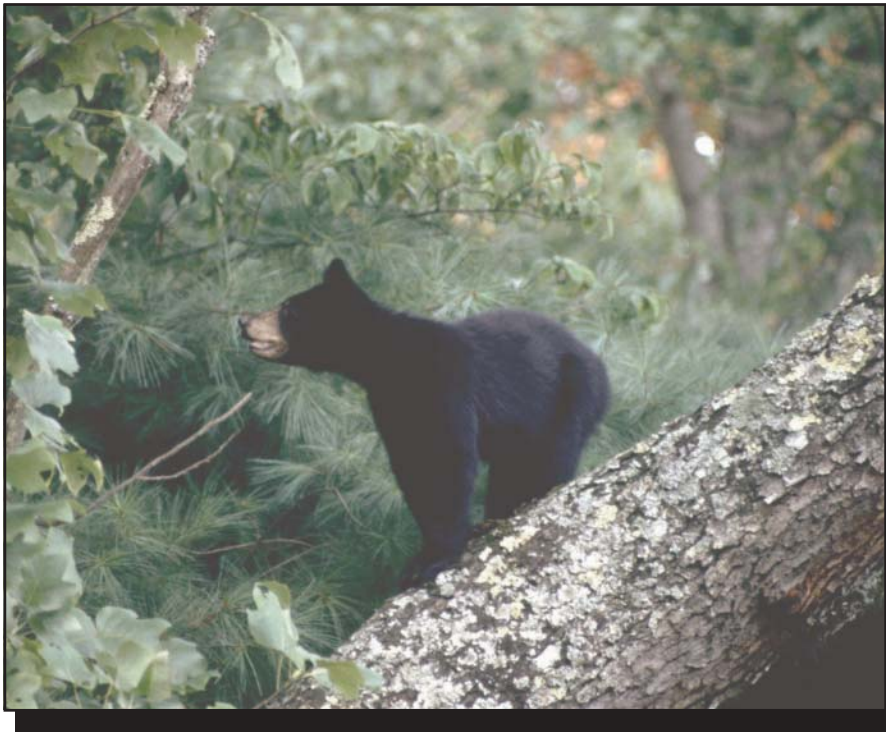
Figure 1—Black bears strip the bark from trees to eat the sapwood.

Bears usually forage on the lower trunk of trees, girdling the bottom 1 to 1.5 meters. Some bears may climb the tree and sit on branches to feed higher up. Bears have been known to strip entire trees. Damage within a stand can be extensive. A single bear can strip bark from as many as 70 trees per day.