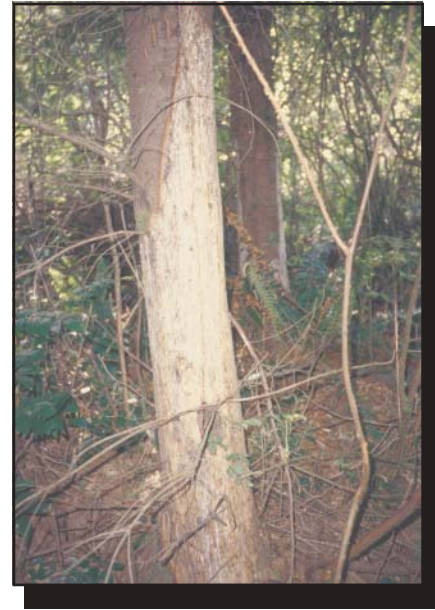
Figures 2a and 2b—Douglas-fir trees peeled by a black bear feeding on sugars in the newly formed wood beneath the bark.