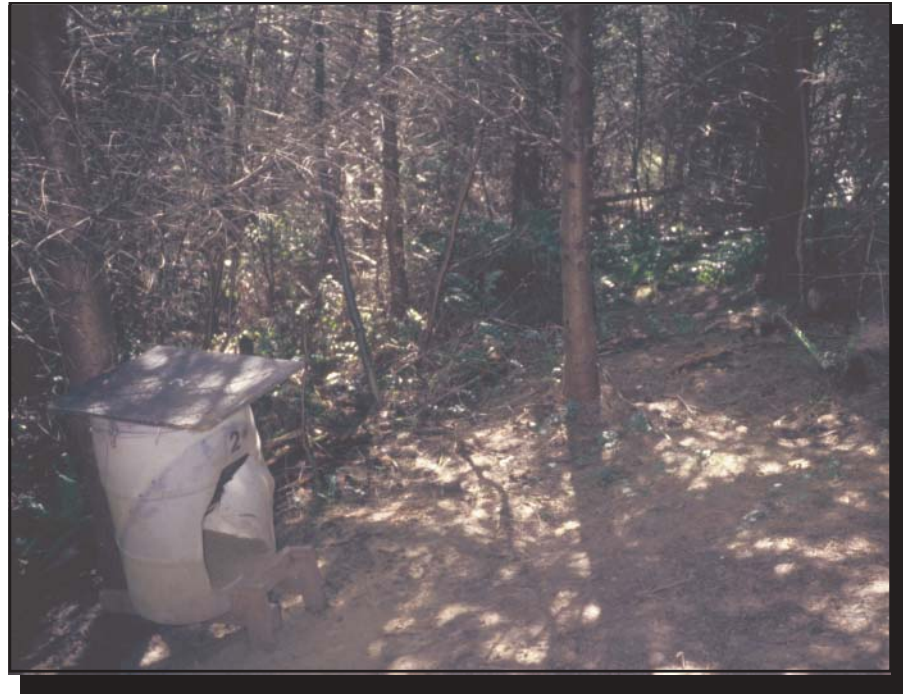
Figure 3—A feeding station that dispenses pellets with a high concentration of sugar. When they had the opportunity, bears tended to feed on pellets rather than strip bark from trees.

Feeding Stations —Most forest managers in western Washington use similar approaches when feeding bears. Feeding stations (figure 3) are constructed from 55-gallon (250-liter) metal or plastic drums. An opening in the front provides access to pellets. A simple self-feeding delivery system prevents bears from spilling pellets. A foam-insulated plywood roof keeps pellets dry. A single feeder holds about 90 kilograms of pellets. Commercial pellets are about 0.6 centimeter in diameter and 1.3 centimeters long. They resemble dry commercial dog food, but are greenish. The sugar concentration in pellets is high (about 20 percent) and