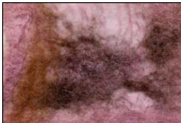
Figure 6. Silk gauze and wool nuno felt dyed with cochineal.

Although most of my work is with silk, I'm also intrigued by how naturally colored or naturally pigmented wool will accept natural dyes. Figure 6 shows a nuno silk and wool piece dyed with cochineal with aluminum potassium sulfate as the mordant. I used different colors of wool fiber (white, camel, light tan, grey, fawn, and brown) when felting the wool through silk gauze. The piece was dyed after felting.