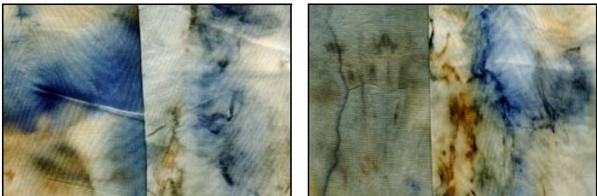
Figure 8. Contact dyed with purple cabbage: alum and copper (left), aluminum foil and copper (right).

Because cabbage is so sensitive to mordants, I made a series of pieces using contact dyeing to explore the potential with the cabbage. I used equal weights of cabbage from the same large head, equal amounts of weak acetic acid or water, and equal amounts of sodium chloride. All pieces were the same size initially and all from the same bolt. I used the same folding method, the same hammer, and pounded them an equal number of times. In the 15 samples created, I varied mordant or combined mordants to determine the range of color possible with this dyestuff. Intense blue occurred with alum and copper and one week of contact dyeing. Less intense colors were achieved using aluminum foil, copper, and two weeks of contact dyeing.