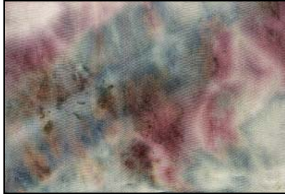
Figure 2. Silk crepe de chine contact dyed with elderberries.

mordant, amount of heat used in extracting the dye, and number of extracts. Purple or maroon is most often produced by the first extract while blue is usually more consistent with the third extract. Use of ferrous sulfate will create browner areas while copper sulfate will produce green areas. The piece shown in Figure 2 was created using contact dyeing with resist areas.