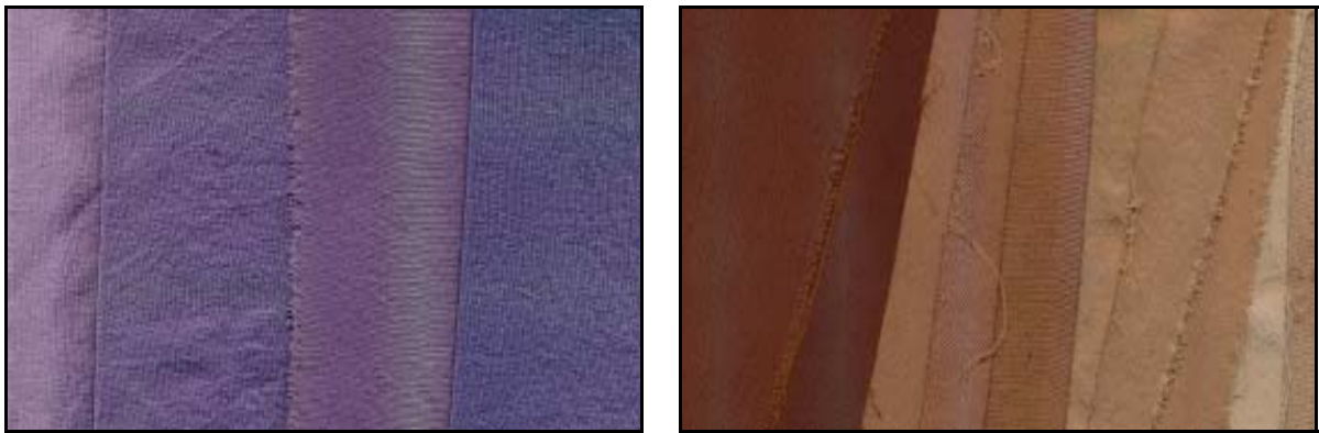
Figure 9. Nontraditional mordants on silk (left) and fermented black walnut on silk (right).

I have explored several other avenues in my research: fermentation of dyes, repeated dyeing of a single textile in the same bath, multiple extractions, and exploration of alternative mordants. Fermentation is used to achieve color in some dyes – notably indigo, woad, and some lichen dyes. The impact of fermentation on more traditional dyes had not been explored. I studied the process of fermentation – hard to find much about it other than in brewing beer or wine or in making bread or cheese. The rust to peach colored samples are fermented with black walnut using a vinegar to shift the fermentation more acidic. Each sample represents a different extract from the fermented walnut hulls. The most intense color is from the first extract. While the lightest color represents the tenth extract. As you can see, there is a difference between each extract. The purple samples represent four mordants on silk with purple cabbage. The mordants used were alum, iron, potassium sulfate, and calcium sulfate. Potassium sulfate and calcium sulfate are rarely used as mordants, but are relatively readily available, low cost, and have minimal impact on the health of the dyer or on the environment.