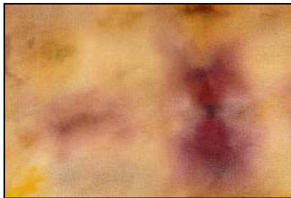
Figure 1. Silk chiffon contact dyed with beets, Osage orange, and daylilies.

The piece shown in Figure 1 was made using red and yellow beets, Osage orange, and daylilies using traditional immersion dyeing, contact dyeing, and microwave dyeing. I've been working with beets to identify a technique get a red or pink color for several years and have discovered that extended microwave dyeing works best. However, most of the red is from the daylilies. Other materials used included oxalic acid, acetic acid and sodium chloride. The yellow beets and Osage orange were added via resist immersion dyeing to silk pre-mordanted with aluminum potassium sulfate. I used contact dyeing for two weeks and solar energy with the daylilies.