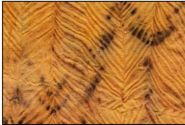
Figure 3. Silk chiffon dyed with goldenrod and resist dyed with aphids.

Resist processes fascinates me. There are only a few artists who combine resist methods with natural dyes and many of them work with indigo. Figure 3 shows a piece of silk chiffon dyed with goldenrod in an immersion process. After it was dry, it was pleated and wound around a PVC pipe, wrapped with thread, aphids harvested from goldenrod were crushed onto a portion of the surface which was then wrapped with a few lengths of barbed wire, dipped in soy milk (processed from my brother's soybeans), wrapped in plastic to keep the dyes and fabric moist, and solar dyed for 10 days.