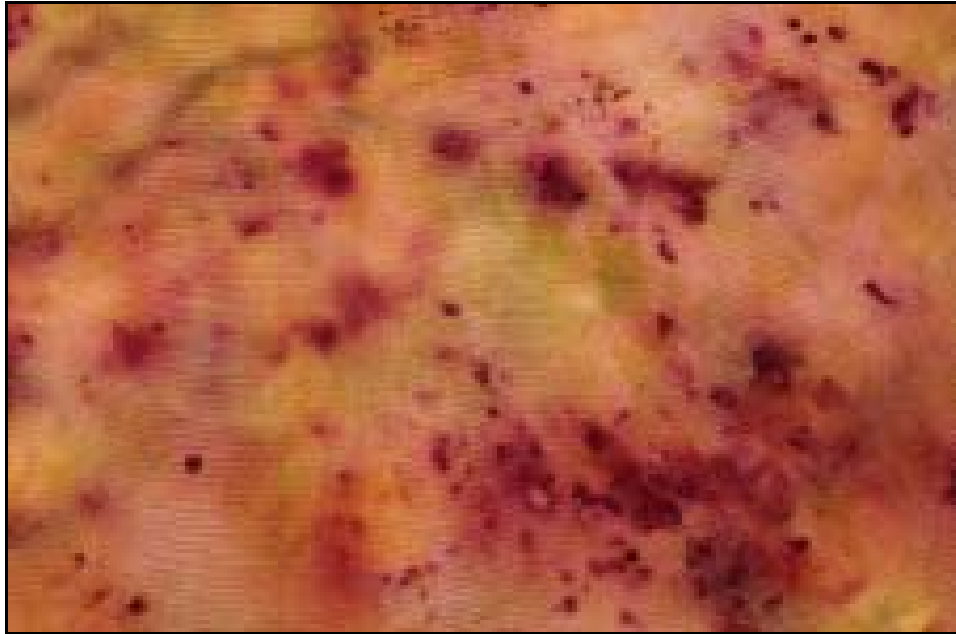
Figure 7. Silk habutai contact dyed cochineal, parsley, catsup, cloves, and marigolds.

Figure 7 shows a piece that combines Iowa grown and exotic dyes: cochineal beetles, parsley, catsup, cloves, and marigolds and was oven dyed. I used a contact dye method, but placed it in a hot oven as a heat source.