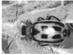
Bean leaf beetle

The tables on page 179 show economic thresholds for beans in 30-inch and 7-inch rows. To use the