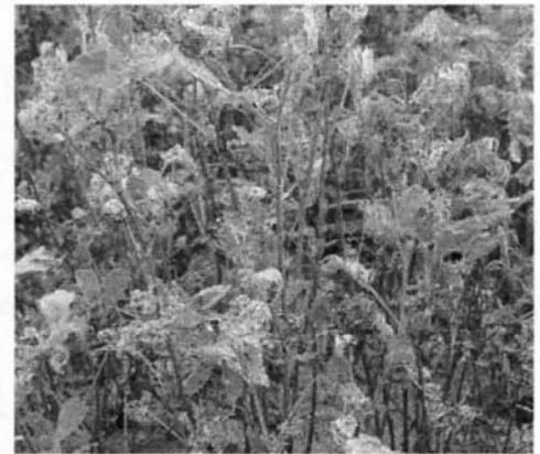
Garden webworm in newly seeded alfalfa.