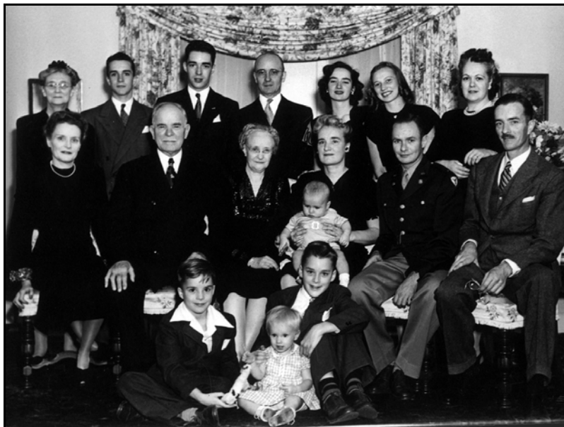
Figure 4. My mother-in-law’s family, 1945.

Two families from opposite sides of the globe collide in the new world called the United States of America, all trace of their cultural and ethnic identity erased. Both boys are dressed in the children’s fashion of the day: white middy suits. 5 The men both wear spotted ties and white shirts with round-tipped collars. Only my grandmother is dressed in ethnic clothing. Ironically, she is the only one of the four adults in the two photographs who was born in a land that was to become part of the United States.