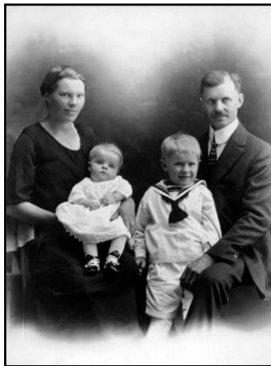
Figure 1. My father-in-law with his parents and infant sister, circa 1923.

So much catch-up to do for a woman who has known the man she married only for a few weeks. Out came the family albums. There was the formal portrait of my husband's father's family: his grandparents, his father dressed in a sailor outfit, and his infant aunt. "We have a picture like this," I said, referring to a photograph in my family's albums.