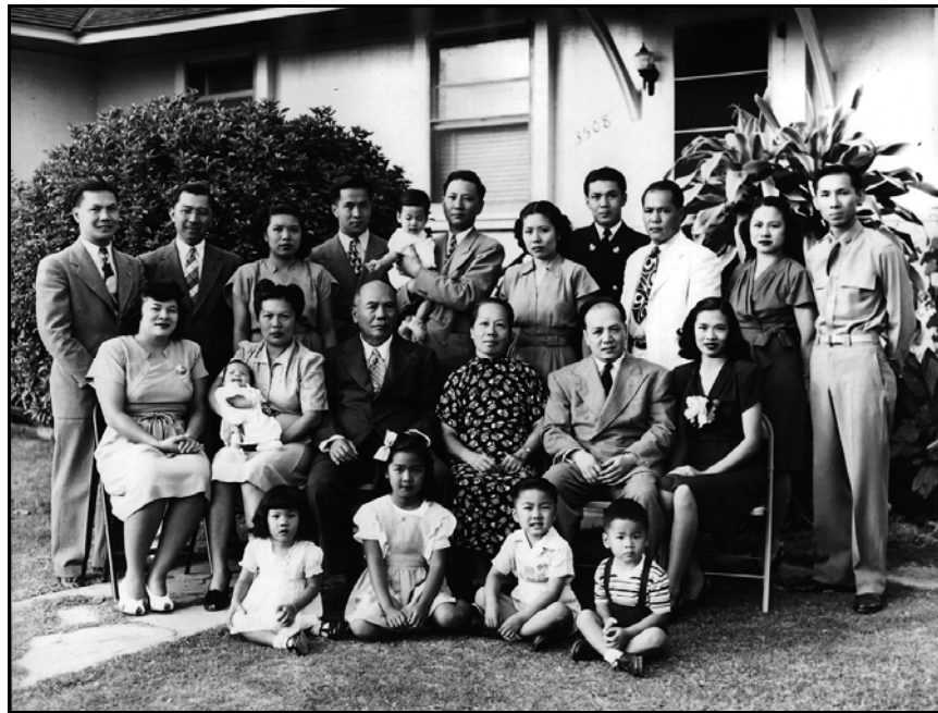
Figure 5. My mother's family, 1946.

My husband's father was also in the Army but does not appear in this photograph because he was stationed in Hawaii. Had he known my mother's family, he would have been able to join our family photo session as the future father-in-law of a future granddaughter.