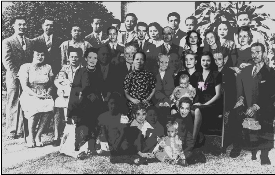
Figure 6. Digital image of “Fourbearers,” by the author. The weaving (not shown) was handwoven on a computerized Jacquard loom in 2007.

Another uncle, standing in the back row, fourth from the left, graduated from Purdue University in West Lafayette, Indiana, in 1945. His first two years overlapped with those of my husband's parents who graduated from Purdue in 1943. Had my uncle met them at Purdue, he might have haggled with them over an acceptable number of chickens and cows to be exchanged for the marriage between his future niece and their future son.