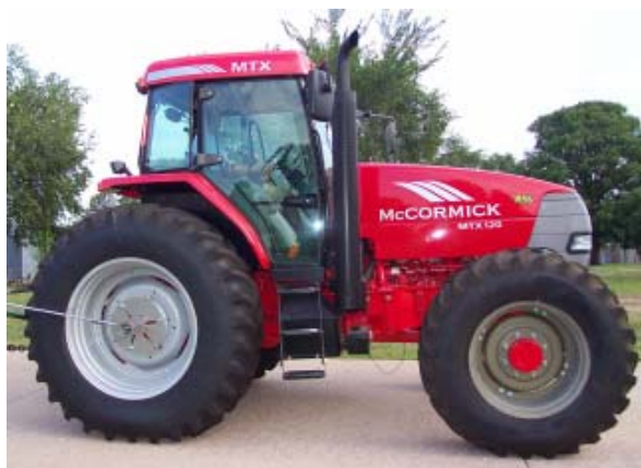
McCormick MTX 120 Diesel

Institute of Agriculture and Natural Resources University of Nebraska—Lincoln