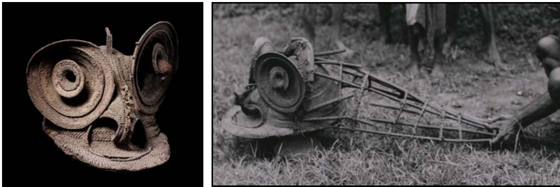
Figure 9 (left). Mask, mivai , 20 th century East Sepik Province, middle Sepik River, Sawos people. Jolika Collection of New Guinea Art, Fine Arts Museums of San Francisco, 2007.44.104.

We can see similarities in technique and materials when we look at another mask also from the East Sepik region—from an area north of the Sepik River. This rare mask from the Sawos people has been built of numerous individual coiled basketry units combined together into an elaborate helmet shape.