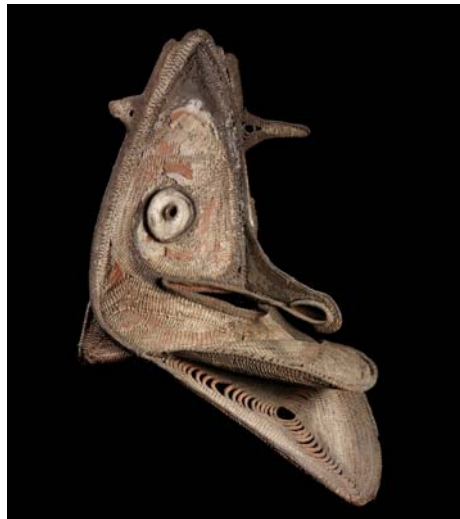
Figure 8. Female Mask, 20 th century East Sepik Province, middle Sepik River, between Karawari (Korewori) and Blackwater rivers, Kapriman village area, Kapriman language speakers. Jolika Collection of New Guinea Art, Fine Arts Museums of San Francisco, 2007.44.57.