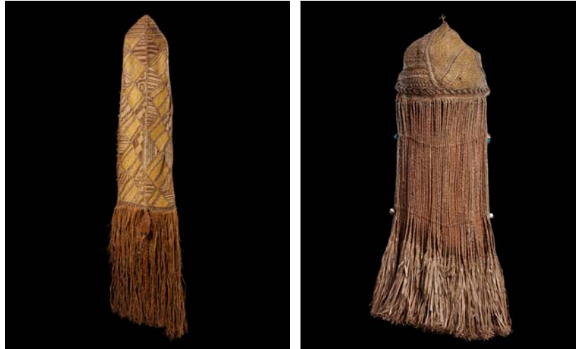
Figure 6 (left). Woman's mourning hood ( kabu ), 19 th –early 20 th century New Guinea, West Papua, Marind-anim people, Yei-nam, Jee-anim sub-group. Jolika Collection of New Guinea Art, Fine Arts Museums of San Francisco, 2007.44.42.

For the Marind-Anim of West Papua, women play an important role in the funerary rites. In what can be seen as the completion of the life cycles, women as the bringer of life are also responsible for caring for and mourning the dead. Women commemorate the dead in their own ceremony makan hawn , which translates to seeing the earth or seeing the places the deceased used to visit. This intricately plaited head covering would be worn by a close female relative, commonly the widower or sister of the deceased, during the woman's mourning procession.