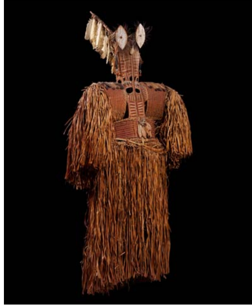
Figure 5. Spirit mask costume ( doroe, dekewar ) for jipae festival, 20 th century New Guinea, West Papua, Asmat people. Jolika Collection of New Guinea Art, Fine Arts Museums of San Francisco, 2007.44.17.

The Asmat believe that the dead do not immediately leave the earth and while they linger there is the potential for danger. 5 The jipae ceremony takes place every few years to commemorate important people who have passed away since the last ceremony and to rid their spirits.