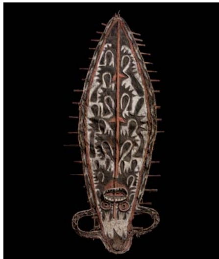
Figure 12. Processional mask, Semese, 19 th century New Guinea, Gulf Province, Gulf of Papua, Motu Motu village, eastern Elema people, Toaripi subgroup language speakers. Jolika Collection of New Guinea Art, Fine Arts Museums of San Francisco, 2007.44.33.

A technical tour de force, this complex mask is composed of bark cloth stretched on a bamboo and rattan framework. In the Gulf of Papua, these large-scale masks were used in elaborate and protracted ceremonial cycles centered around the initiation of boys.