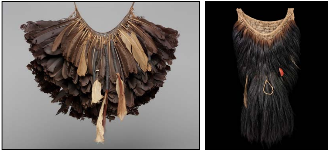
Figure 1 (left). String bag ( kabeel men ), 20 th century New Guinea. Figure 2 (right). String bag ( tiyaapl men ), mid-20 th century New Guinea. Both Figures: Upper Sepik River, Mountain Ok people. Jolika Collection of New Guinea Art, Fine Arts Museums of San Francisco, (left - 2007.44.79) (right - 2007.44.135).

thing.” 1 In addition, the bilum bag serves as a marker of clan membership with each cultural group employing their own unique combination of raw materials, dyes, design elements, applied accessory objects, and variations of the looping technique. Women are primary creators of the bilum bag; however, there is a division of labor in bilum making that is not consistent throughout New Guinea. While most commonly men’s bilum making is limited to the creation of ritual bags and attire using tight looping techniques or in embellishing bilums worked by a woman, in some highland groups men also create a functional open looped bilum. For the Mountain Ok people, the string bag, embellished with bird feathers is a signifier of male initiation. This kabeel men adorned with the feathers of the hornbill bird marks the third phase of initiation for a young man.