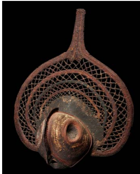
Figure 11. Yam mask, Baba Mini , 20 th century New Guinea, East Sepik Province, Prince Alexander Mountains, Abelam people, Wosera subgroup. Jolika Collection of New Guinea Art, Fine Arts Museums of San Francisco, 2007.44.24.

Further north of the Sawos reside the Abelam people. The Abelam revere yams as a dietary staple and as objects imbued by powerful spirits. 15 This small yam mask, measuring just 27 inches in height, called a baba mini , was probably used to decorate the finest yams in annual exchange ceremonies and competitions celebrating the harvest.