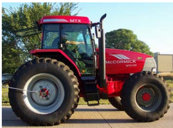
McCormick MTX 135 Diesel

Institute of Agriculture and Natural Resources University of Nebraska—Lincoln