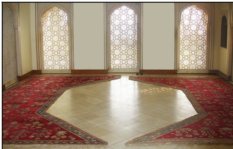
Figure 1. Pair of 17 th Century Mughal Carpets, Photographed in Doris Duke's Bedroom at Shangri La. Cotton, Silk, and Wool.

In addition to being historically significant markers of an aesthetic tradition, the carpets stand alone as important works of art due to their unusual shape and pairing. Each carpet has an arched interior with pointed ends. When paired, the carpets form a bold field of flowers with an interior void wherein a person, most likely of royal personage, could have sat in splendor. Imagine the feeling of wealth and luxury felt by those in the Mughal courts as they sat surrounded by effervescent flowers on carpets, textiles, architecture, and precious objects while ruling over a vast empire (Fig. 1).