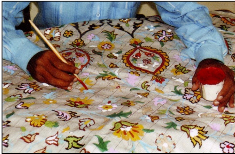
Figure 6. Painting the design.

take inspiration from prototypes, often looking at examples found in books with photographs of famous carpets found in museum collections.