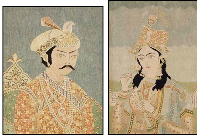
Figure 2. Pair of Embroidered Portraits, Northern India (Delhi,) CA.1850, cotton fabric with cotton embroidery.

In 1526, Babur, an emigrant prince from Central Asia, established the Mughal dynasty in South Asia. By 1600, the dynasty was both economically and politically prosperous, ruling a large geographic area divided today into Pakistan, Afghanistan, Kashmir, and Northern India. During their 330-year reign, the Mughals gained an international reputation for their wealth, tolerance, and intellectual and artistic pursuits. Their influence survives to the present in the word “mogul,” which denotes a lifestyle of power and luxury.