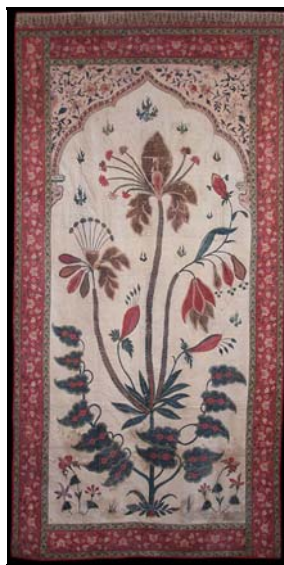
Figure 3. Tent Hanging, Northern India, 18 th Century, cotton with textile prints.

As a prince in Central Asia, Babur was accustomed to a semi-nomadic lifestyle. It was the practice of his ancestors to move their courts around the empire, and in particular to set up tents in gardens from which they would rule and entertain. One of Babur’s first acts in South Asia was to establish a garden, a practice his successors continued with increasing grandeur. Among the most visited Mughal gardens is that of the Taj Mahal, a mausoleum built in a garden complex by the fifth Mughal emperor Shah Jahan in 1635.