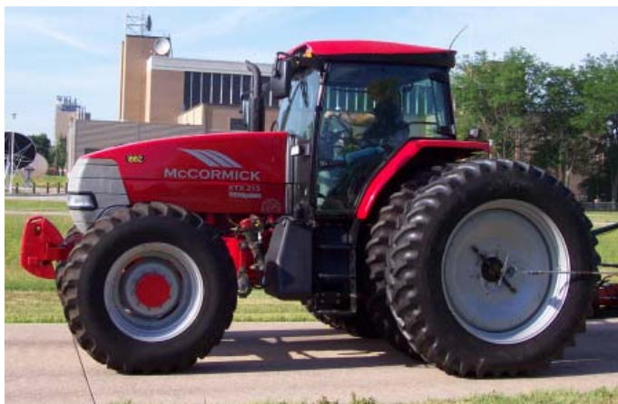
McCormick XTX 215 Diesel

Institute of Agriculture and Natural Resources University of Nebraska-Lincoln