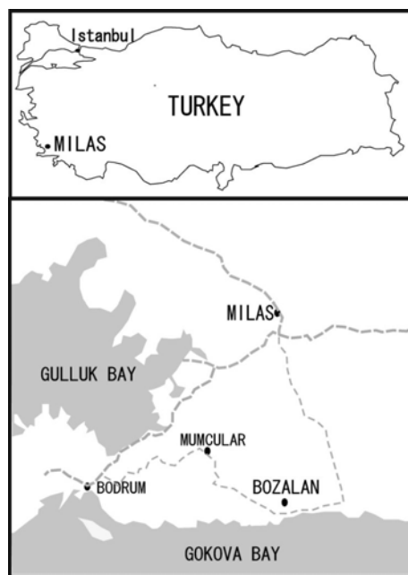
Figure 1. Maps of Turkey and Milas region. Drawing by author.

This documentary, filmed in 2006, examines the process of naturally dyed carpet production in a village in the Milas region of Muğla Prefecture in southwest Turkey, a region well known as a traditional Turkish carpet production area. In large numbers of villages of this region, carpet weaving is the household based work of every woman who lives there.