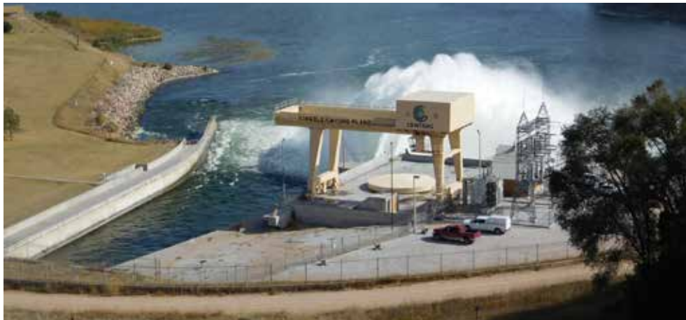
Kingsley Hydro Plant and Lake Ogallala just east of Lake McConaughy.