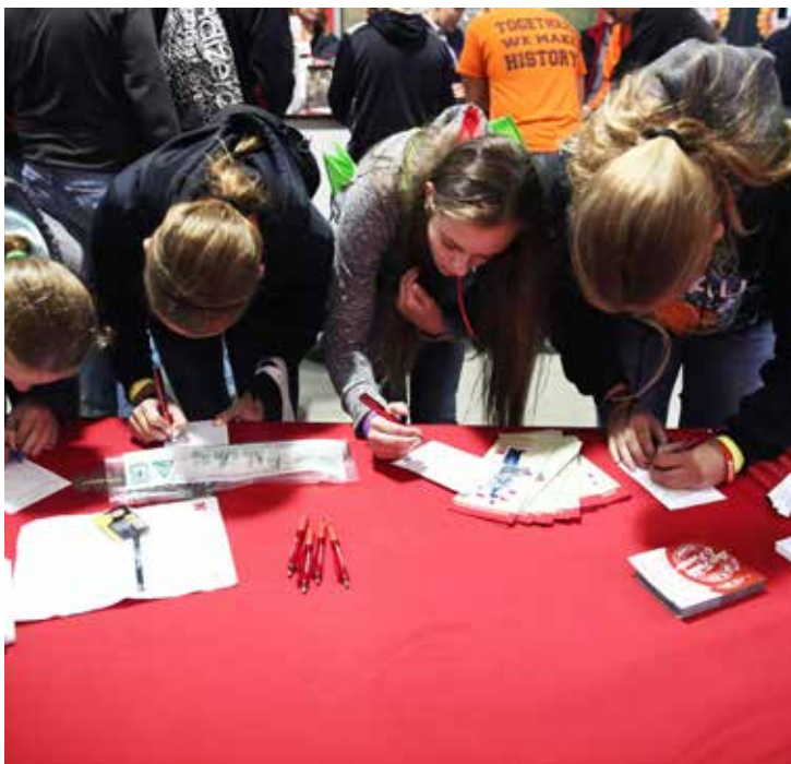
Students sign-up for IANR College of Agricultural Sciences and Natural Resources on-grounds scavenger hunt.