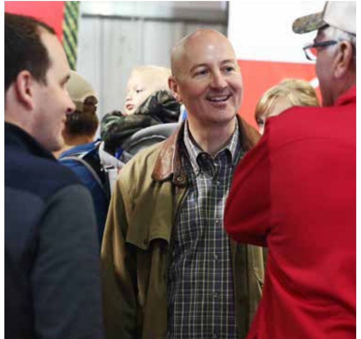
Governor Pete Ricketts visits UNL exhibits.