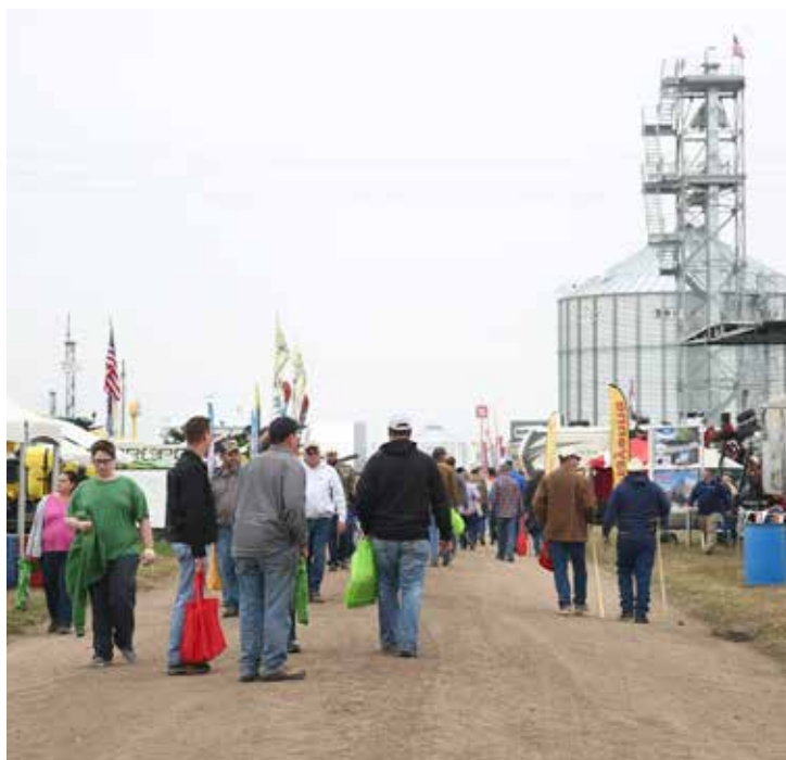
Crowds through the Husker Harvest Days farm show near Wood River.