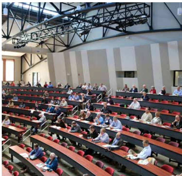
Symposium attendees begin filling the NIC conference room.