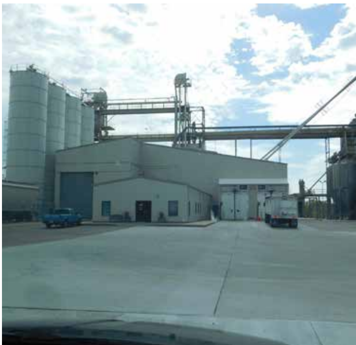
Gothenburg's Frito-Lay corn handling facility is one of the largest such facilities in the U.S.