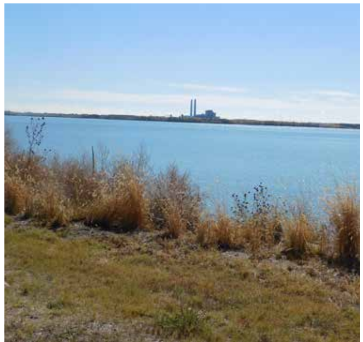
Nebraska Public Power District's Gerald Gentleman Station and Sutherland Reservoir.