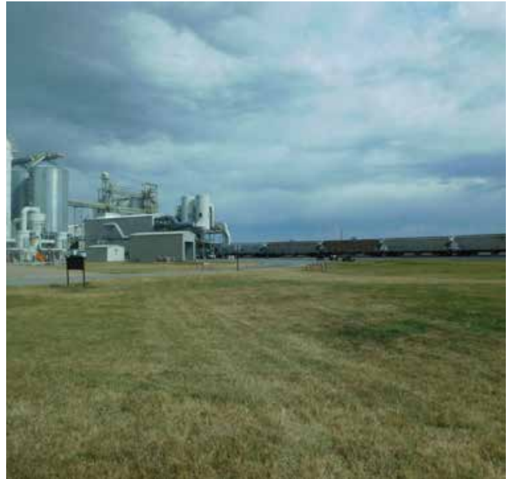
Rail cars at Frito-Lay's Gothenburg corn handling facility.

The latest tour information will be online at watercenter.unl.edu . Organizers anticipate limiting registrations to about 55 people and to opening registration in early May 2017.