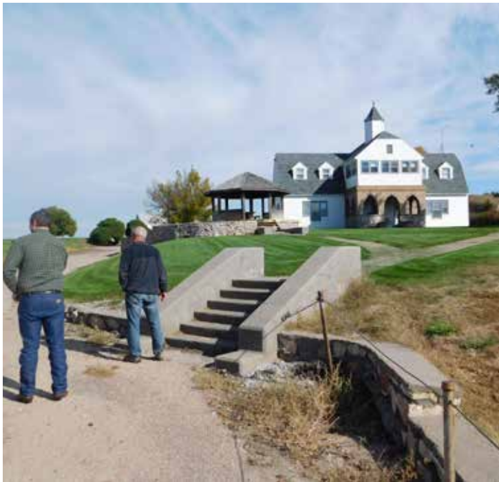
The Central Nebraska Public Power and Irrigation District's historic Jeffrey Lodge near Brady.