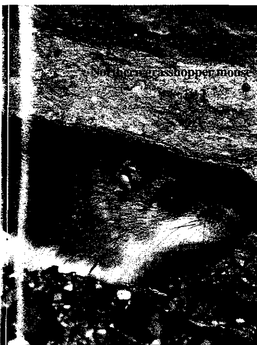
Northern grasshopper mouse