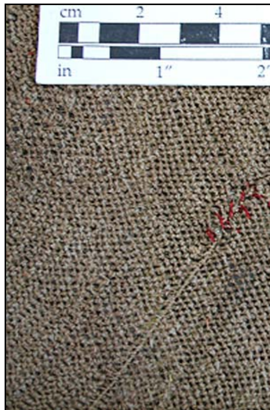
Figure 4. Chapman Cloak, olona netting. The Bishop Museum, Honolulu, Hawai'i.

The gauge of the netting varies from cloak to cloak, as well as from patch to patch. Differences in netting gauge can also be seen in feather color and design areas: larger feathers conceal more netting, allowing a larger gauge (and therefore less cordage) to be used. The Chapman cloak is thought to be the oldest in the collection, dating to the mid-18 th century, and it is also the most deteriorated. Believed to have been taken to Calcutta, India, in 1826, it was purchased for the Bishop Museum collection in 1937. Its voyages undoubtedly played a part in the poor condition