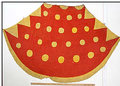
Figure 2. Joy Cloak. The Bishop Museum, Honolulu, Hawai'i.