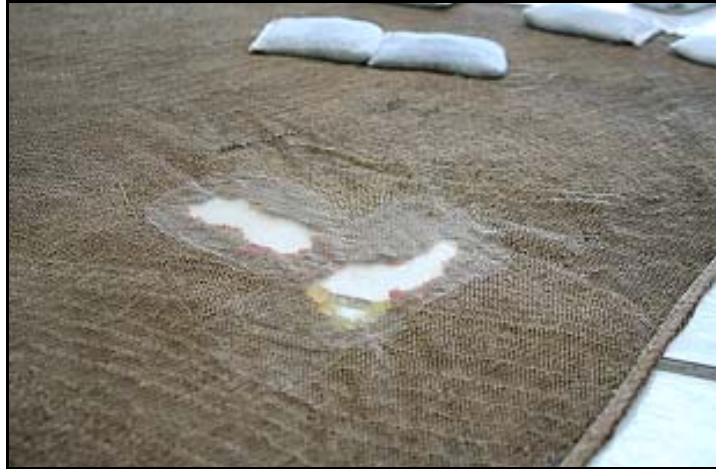
Figure 7. Chapman Cloak – sample of loss stabilization. The Bishop Museum, Honolulu, Hawai'i

The Chapman cloak has three large losses. No documentation of the cause of these losses exists, raising questions about how to conserve them for exhibition. They could originate from the use of the cloak as a battle garment, or they could have occurred at any point during its later life. The losses were not filled because it would not accurately represent the cloak's history, even though the damage cannot be interpreted to a specific moment in time. The losses had distortions around the edges that needed to be flattened before the tears could be repaired. The distortions were flattened with local humidification and pressure, and then repaired and stabilized in the same fashion as the other tears. 3 In addition, a double layer of the nylon mesh was sewn in place to prevent further stress at the edges of the loss. The brown mesh that was used to stabilize the area also seemed like a good compromise. It mutes the appearance of the black background of the mount, but does not hide the loss (Fig. 7).