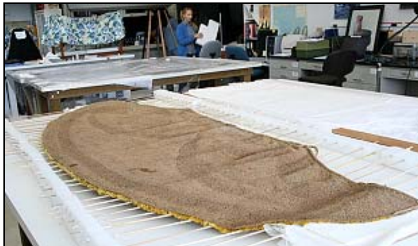
Figure 8. Joy Cape support. The Bishop Museum, Honolulu, Hawai'i.

The Chapman cloak has three large losses. No documentation of the cause of these losses exists, raising questions about how to conserve them for exhibition. They could originate from the use of the cloak as a battle garment, or they could have occurred at any point during its later life. The losses were not filled because it would not accurately represent the cloak's history, even though the damage cannot be interpreted to a specific moment in time. The losses had distortions around the edges that needed to be flattened before the tears could be repaired. The distortions were flattened with local humidification and pressure, and then repaired and stabilized in the same fashion as the other tears. 3 In addition, a double layer of the nylon mesh was sewn in place to prevent further stress at the edges of the loss. The brown mesh that was used to stabilize the area also seemed like a good compromise. It mutes the appearance of the black background of the mount, but does not hide the loss (Fig. 7).