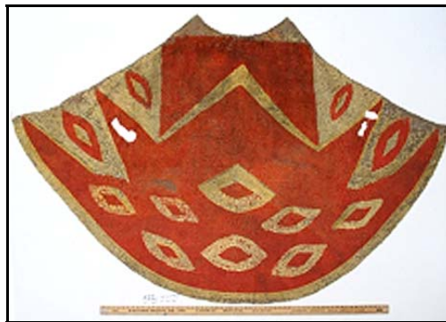
Figure 1. Chapman Cloak. The Bishop Museum, Honolulu, Hawai'i.

Sacred garments worn by the male members of the Hawaiian ali'i , or chiefs, these feather cloaks and capes serve today as one of the most iconic symbols of Hawaiian culture. During the summer of 2007 the Bishop Museum in Honolulu, Hawai'i, under the supervision of its conservator, Valerie Free, commenced a project to stabilize the cloaks so that they could be safely exhibited in the museum. This project was funded by a grant from the Institute of Museum and Library Services.