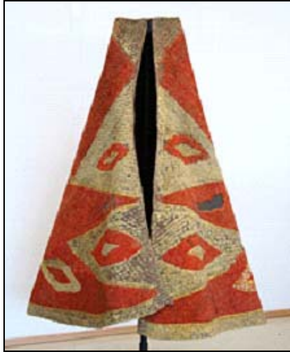
Figure 9. Chapman Cloak on mount. The Bishop Museum, Honolulu, Hawai'i

This mount displays the cloak in the round, with gently undulating folds in the fabric, and at the same time distributes the weight of the cloak over many points of contact with the structure, relieving stress on the object itself (Fig. 9). The liner distributes the weight of the cloak while reducing stress on the netting during mounting because the Velcro on the mount attaches to the liner, and not the cloak. The felt liner also helps when moving the heavy and awkward textile and can be kept with the cloak in storage. Thus, these mounts are a compromise between representation and conservation. The actual construction requires many adjustments for each cloak as each one varies greatly in its length, width, curvature of the neckline, and bottom edge. This mount is a workable solution for the longer capes, but the smaller Joy cloak will be displayed flat with a padded support.