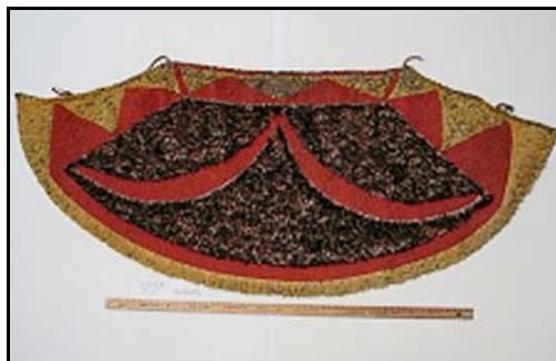
Figure 3. Joy Cape. The Bishop Museum, Honolulu, Hawai'i.