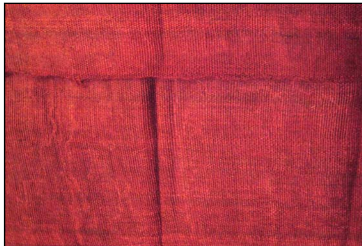
Figure 3. Detail of şal şepik cloth, in which the moiré effect can be seen, particularly on the lower left. Two lengths of cloth are overlapped, showing the selvage. The characteristic creases that result from the pressing are also visible. Note that one crease is sharper than the other; the length of fabric is rolled, so that on inner layers the creases are sharper and closer together, while outer layers have softer creases that are further apart.

The first encounter with these weavers included the preparation of the warp in an outdoor park, where the fair was being held— unfortunately on a day when my camera developed a dead battery. But the process of preparing the warp answered the question that early European mohair weavers could not solve: how do you make slippery mohair fibers hang together under tension in the warp? The answer, was sizing. The warp was spread out full length between two rods, but already threaded into its reed.. This arrangement was supported at waist height by posts at each end. I was told that before winding the warp the handspun yarn was simmered in hot water to set the twist. A special mixture that includes apricot pits and asphodel root ( çirîş ) is boiled to a syrupy state, strained and then painted onto the stretched warp. The reed can be run back and forth to prevent the warps from sticking to each other. The resulting glossy, smooth finish can withstand the friction and stress of the loom, and may also contribute to the glossy surface of the finished cloth, with its moire patterning (Fig. 3).