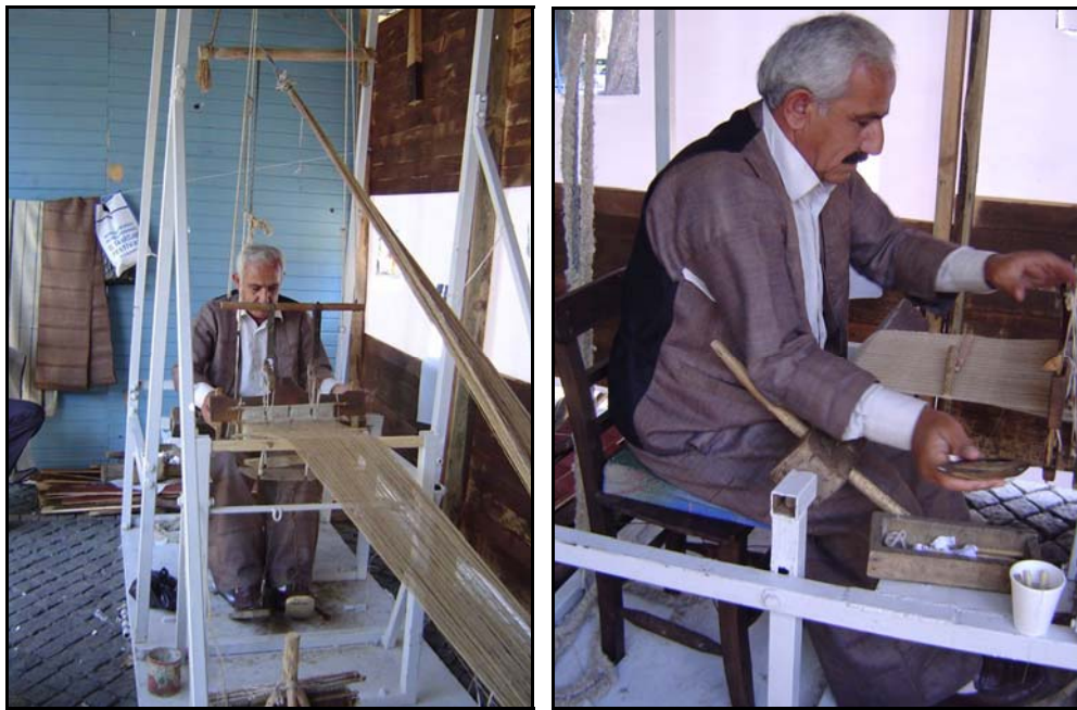
Figure 1 (left). Mohair cloth loom from Şırnak. The weaver is the Director of the Şırnak Community Development Bureau, which has organized a cooperative to promote the weaving of their traditional mohair cloth. This is a typical Anatolian textile loom, characterized by the wrap-around tensioning system.