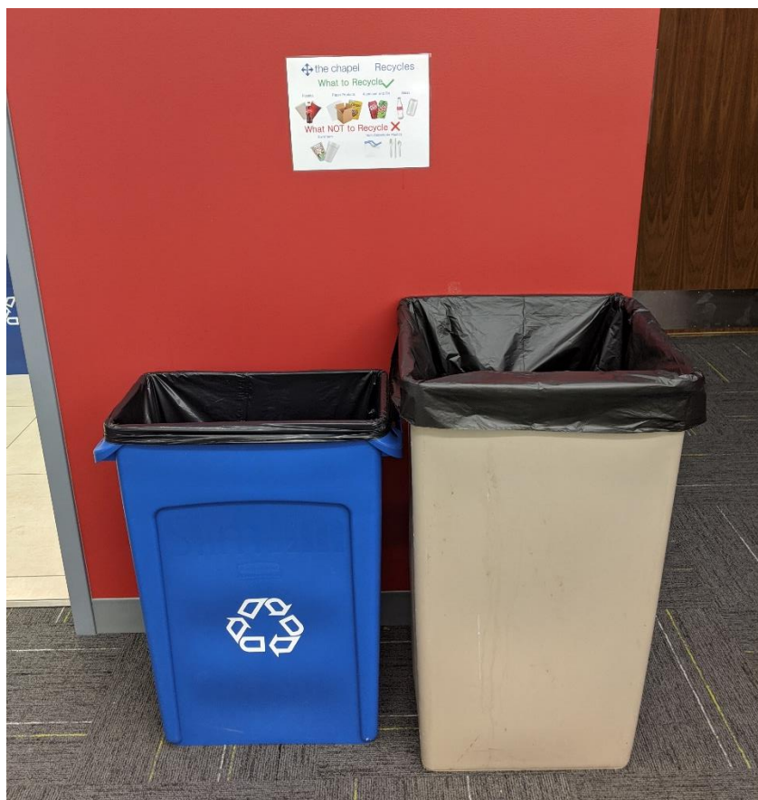
Figure 4: Trashcans were placed next to recycling bins with a sign above them, describing recycling practices. The sign was a little below eye-level so it would catch the eye of the would-be recycler. April 10, 2020.