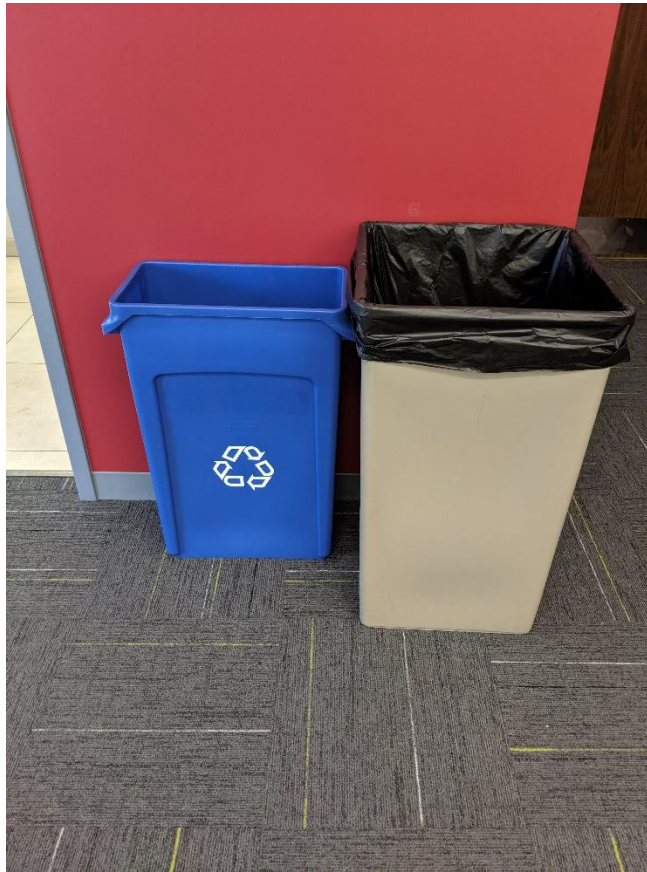
Figure 2. Recycling bins placed adjacent to trash cans without a recycling infographic above the recycling bin for the baseline testing.

Beginning with the second week, black trash bags were also placed inside the recycling bins. December 19, 2019.