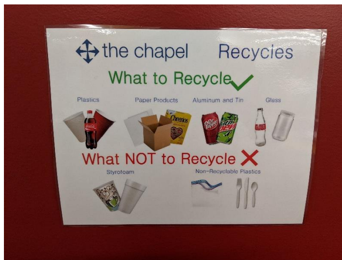
Figure 3: The sign that hangs above each of the recycling bins in ULC. The sign shows with pictures what can and cannot be recycled in the bins. April 10, 2020.