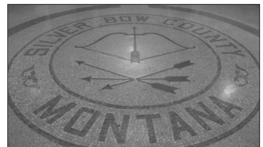
The cover photo shows the elaborate stained-glass dome of the Silver Bow County Courthouse, which opened in 1912 in Butte, Montana; the floor shown below is also from the courthouse.

©2009, American Judges Association, printed in the United States. Court Review is published quarterly by the American Judges Association (AJA). AJA members receive a subscription to Court Review . Non-member subscriptions are available for $35 per volume (four issues per volume). Subscriptions are terminable at the end of any volume upon notice given to the publisher. Prices are subject to change without notice. Second-class postage paid at Williamsburg, Virginia, and additional mailing offices. Address all correspondence about subscriptions, undeliverable copies, and change of address to Association Services, National Center for State Courts, Williamsburg, Virginia 23185-4147. Points of view or opinions expressed in Court Review are those of the authors and do not necessarily represent the positions of the National Center for State Courts or the American Judges Association. ISSN: 0011-0647.