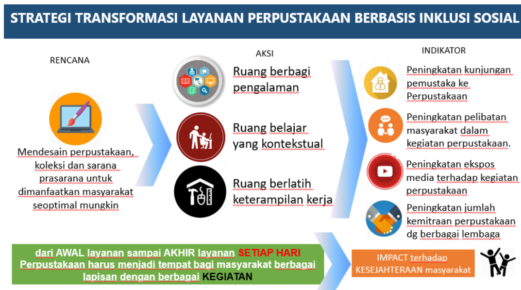
Figure 1. Social Inclusion-Based Library Service Strategy