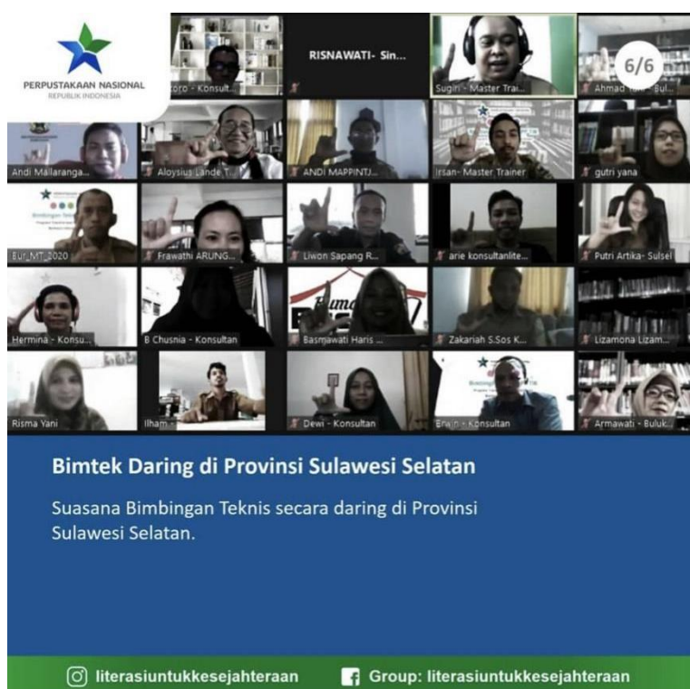
Figure 5. Online Technical Guidance for Facilitators