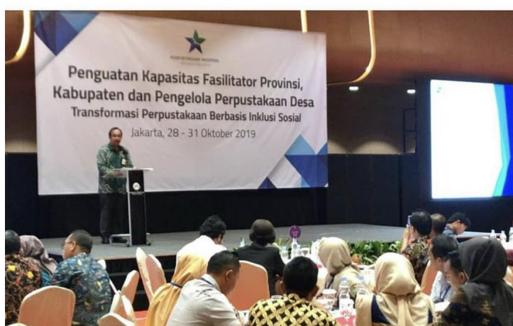
Penguatan Kapasitas Fasilitator Provinsi, Kabupaten, dan Pengelola Perpustakaan Desa, Transformasi Perpustakaan Berbasis Inklusi Sosial.