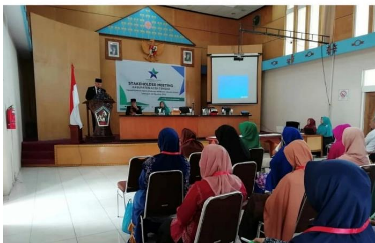
Kabupaten Aceh Tengah, Aceh