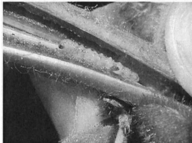
Reports of the soybean stem borer, a relatively new pest to Nebraska, increased this year in south central counties.

Foliar insecticides treatments are not effective against the larvae and are not economically feasible against the adults because of their