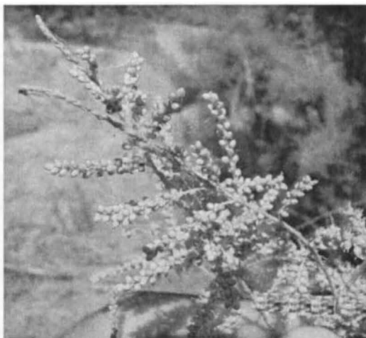
Saltcedar features a bright pink flower.

9) Be safe. As with all pesticide applications, read the product label thoroughly and follow directions carefully.