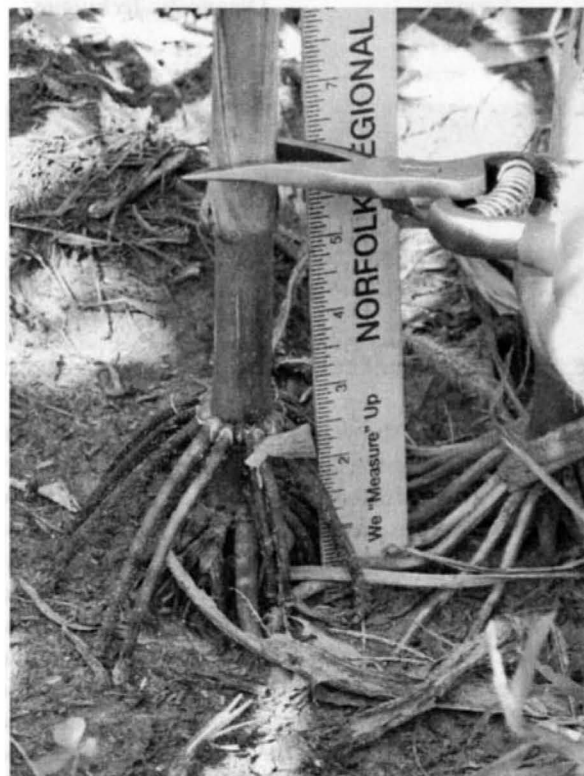
Take an 8-inch segment of corn stalk from 6 inches to 14 inches above the ground.

This season, if the test comes back in the "excess" range, that indicates that reductions in nitrogen may be possible next season. (For more information on recommended rates, see the NU Extension NebGuide, Fertilizer Suggestions for Corn, G174 , available online at http://ianrpubs.unl.edu/fieldcrops/g174.htm or visit the Web site, Managing Nitrogen Efficiently in Nebraska Crop Production at http://cropwatch.unl.edu/