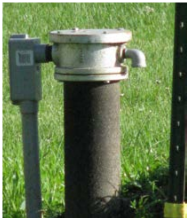
Sharon Skipton, Southeast Research and Extension Center

There is no single test to determine the safety of drinking water. Testing for bacteria and nitrate does not guarantee the water is safe, as other contaminants could be present. Aquifers, which supply groundwater, are vulnerable to many types of contamination. Contaminants