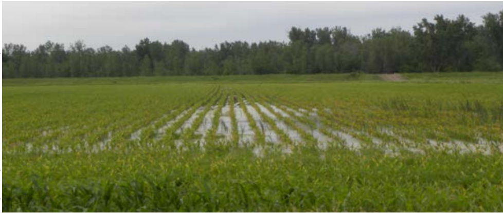
Gary Lesoing, UNL Extension in Nemaha County

Previous on-farm research conducted in Missouri has indicated mid-season nitrogen application may be economically feasible. In Northwest Missouri in 2013, local ag suppliers were flying on urea to