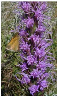
A skipper on a gayfeather flower head.

Soni Cochran, UNL Extension in Lancaster County