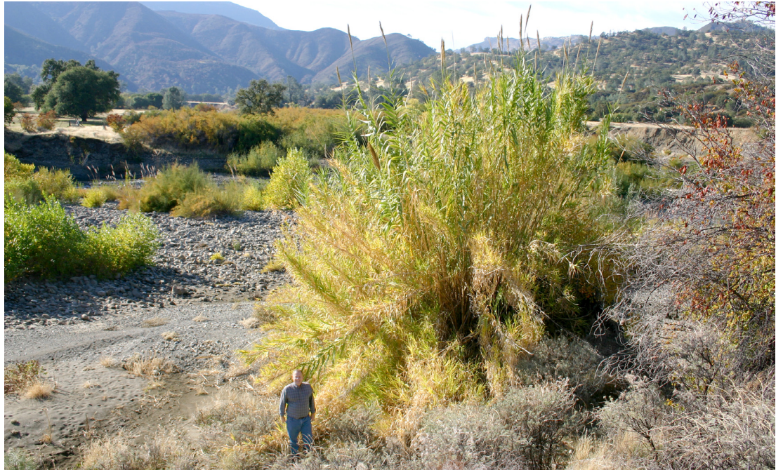
Figure 2. Giant reed ( Arundo donax ) can reach 30 feet in height.

taxon, however, because many important invasive species fail to produce fertile seed, yet they are able to colonize vast regions and inflict economic and ecological damage (e.g., giant reed: Arundo donax as shown in Figure 2).