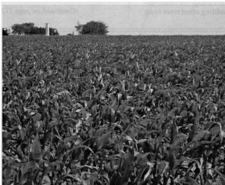
Yellow leaves in "buggy-whipped" corn likely resulted from early season herbicide damage.

plant. Just as frequently, twisted whorls occur in some hybrids as the plants transition from young pre-V5 seedlings to the rapid growth phase.