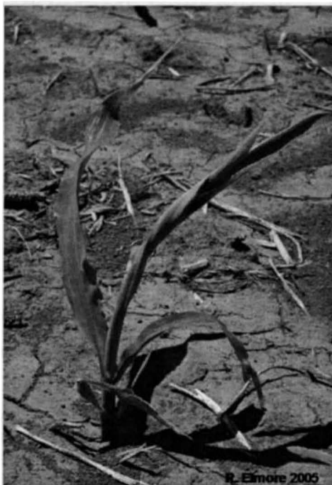
"Buggy-whipped" corn near Clay Center.