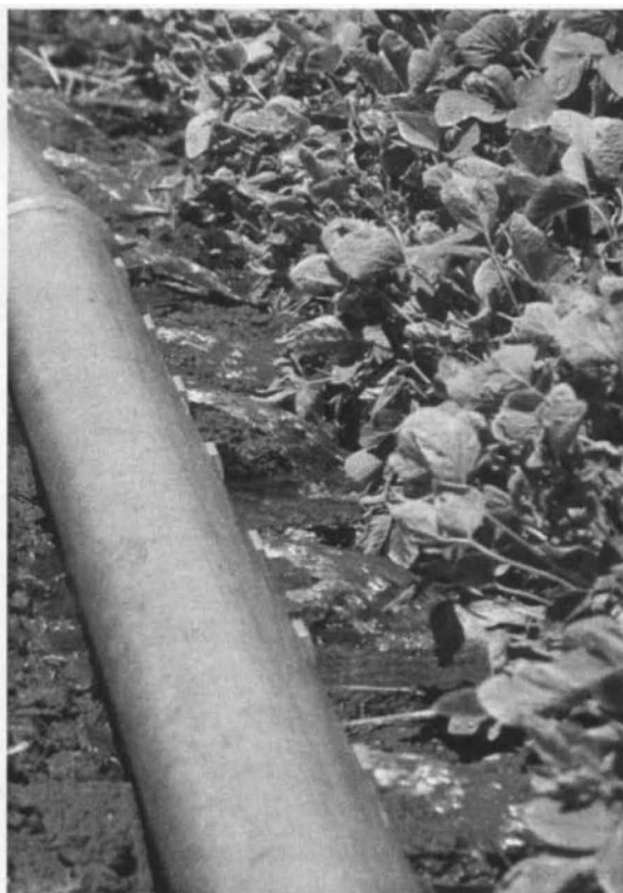
Fixing leaky gates and gaskets in a furrow irrigation system can lead to significant savings of water and irrigation time leading to a reduction in production costs.

Most gated pipe systems have leaks. People sometimes dismiss small leaks, assuming it doesn't amount to much water and after all, the leak is watering a row, right? Wrong on both counts! Logic tells you that one or two gallons per minute isn't going far down a furrow. If you could irrigate with that flow rate, you wouldn't need sets. Regarding the amount of water loss, losing 150 gpm is common on one-half mile of pipe. A single leak of 1.5 gpm on each 30-