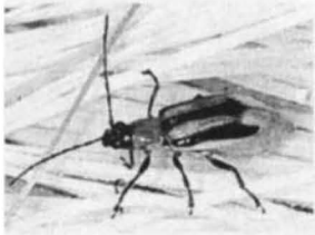
Corn rootworm beetle

Western corn rootworm beetles began emerging in late June in southeastern and south central Nebraska. Beetle emergence will be somewhat later in northeastern and western Nebraska. Beetles emerging before silk