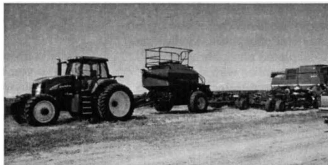
No-till air seeder and fertilizer application unit on the Mark Watson farm, Alliance, Nebraska.

The fallow period has been the traditional time for nitrogen placement and anhydrous ammonia has been used because it is the lowest cost source. During the past few years many farmers have changed to dry or liquid nitrogen sources due to dry conditions or source preference to limit preplant nitrogen and possibly risk. Crop and soil moisture conditions are monitored through the late fall, winter and early spring and then additional nitrogen is topdressed during spring. This spreads out risk, but it comes with a higher price tag. A comparison of 60 lb nitrogen and 30 lb phosphate including application costs is shown below. Fertilizer prices stated above were used as well as an application cost of $3.50/ac for each source. Ammonia application is higher but it is often put