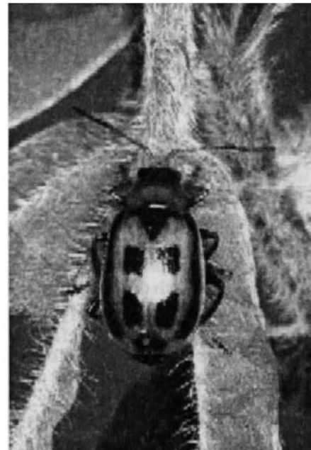
Bean leaf beetle

ones seen early in the year feeding on seedling soybeans. These beetles feed, mate, lay eggs and die in early-mid June. Usually there is a distinct period from mid June to early July when few if any beetles are present in the field, before the first generation emerges. Total developmental time from egg to adult can range from 25 to 40 days. Because of this range of development, it is common to see adults from the first generation and the second generation in the field at the same time. In other words, the generations overlap and beetles will be present at some level from mid-July until the end of the growing