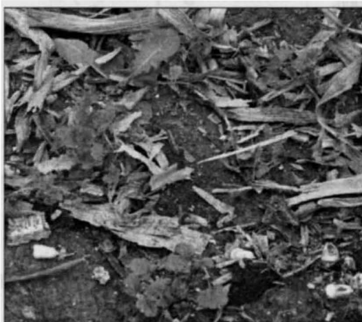
Close inspection may be necessary to identify young winter annuals amid the crop residue in your fields, but it's well worth the effort to provide control in the fall before they have a chance to grow and use valuable soil moisture.

Typically herbicides such as 2,4-D, dicamba, and glyphosate work well and inexpensively on newly germinated winter annual weeds in the fall. Before using a particular herbicide check to make sure it's labeled for fall application. Atrazine does not have a label for fall application in Nebraska.