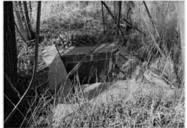
Open, abandoned wells can be a safety hazard to small children and animals as well as threaten water quality.

These wells can allow surface runoff to flow directly down to the water-bearing zones, often carrying organic wastes, fertilizers, and other chemical residues such as pesticides and petroleum products into the groundwater. Small animals can fall into these wells, further adding to the contamination. Once groundwater is contaminated, it is difficult,