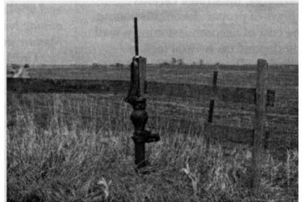
Nebraska law requires that old, unused wells be decommissioned following state guidelines to protect one of the state's greatest natural resources, its water.