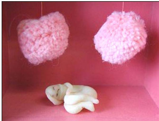
Figure 4. Pom-Pom Diorama , 2005. Artist: Candice Tarnowski. 9.5 cm x 9.5 cm x 5 cm.

Those kinds of kitschy objects show up, you know, a kind of aesthetic which is not mine, really not mine, but it tickles me. I always need to grab and put it somewhere and make a quotation mark around it, you know, its there! And this is my medium and sometimes secret techniques, you need to mix the two, because you see some kind of intricate embroideries that if I took the time to embroider may be a little bit cozier, and you know, the aesthetic of these objects are not right, but the emotion of these things, they want something better ~ something nicer, and I can see that notion behind it, they want to do something.