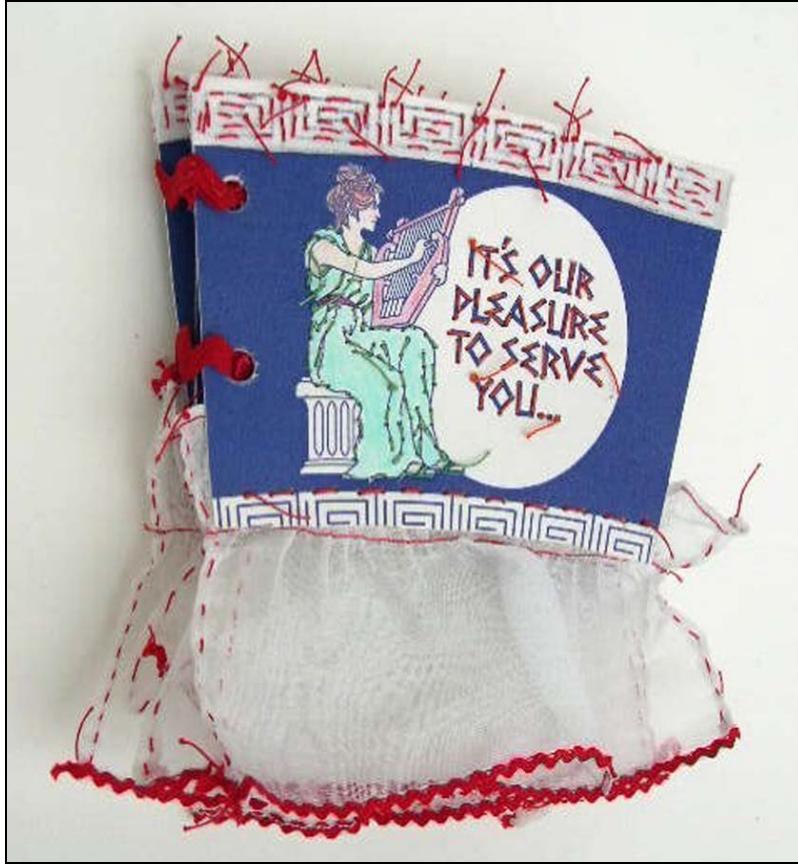
It's Our Pleasure to Serve You. 1997. Paper cups, thread, pencil, cloth.