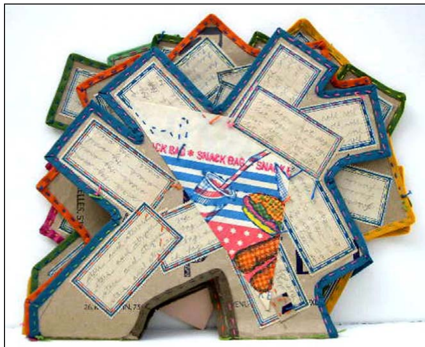
Fast Food. 1995. Paper, labels, pencil, seam binding, thread, empty French fry wrappers.