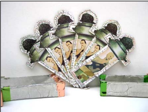
Gautier Fan (left). 1991. Tin, copper, paper, tape, cardboard.