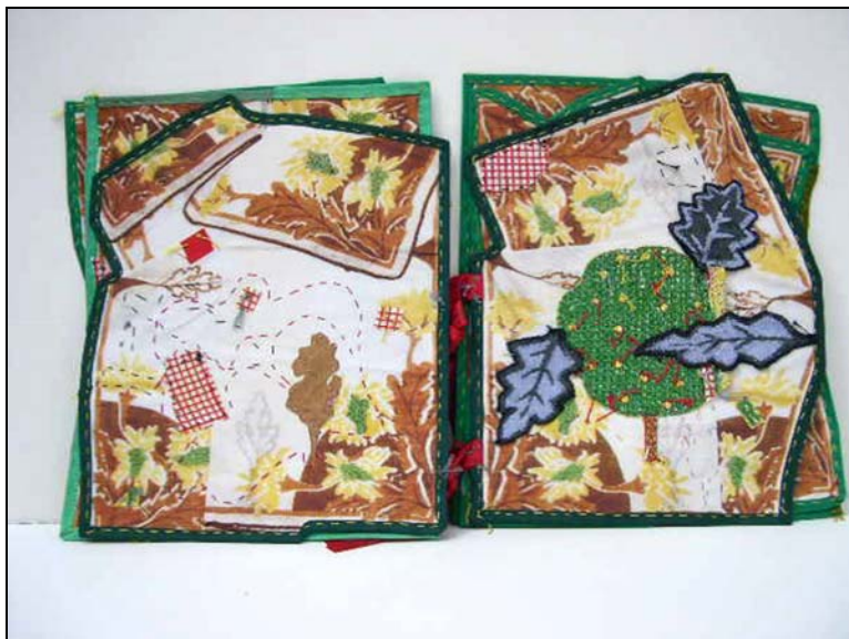
Digital Hankie. 2000. Paper, ribbon, thread, cloth, scanned images.