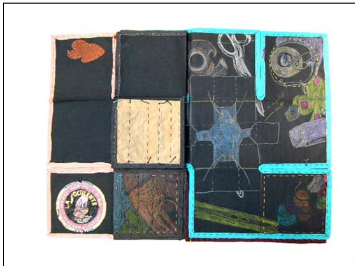
Marriage 1854. 1991. Cloth, found papers & objects, thread, paper.