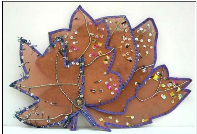
Leaf Fan Book (right). 1991. Metal, cloth, thread copper.