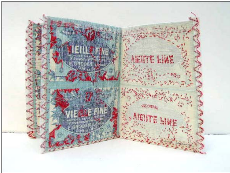
Vielle Fine. 1987. Belgian liquor labels, thread, mull.

Today these books remain remarkably playful and relevant.