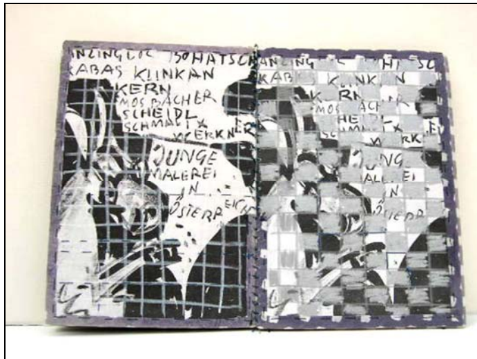
Gray Book. 1981. Postcards from Basel art fair, plastic, thread, pencil.