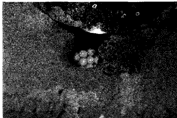
PLATE 2. Loggerhead turtle depositing eggs.

Comparative analyses were conducted where activity