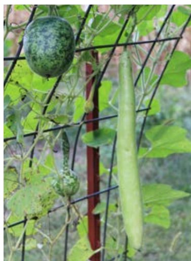
Vicki Jedlicka, Nebraska Extension in Lancaster County

Curing can take one to six months, depending on the type of gourd. The outer skin hardens in one or two weeks, while the internal drying takes at least an additional month. Poke a small hole in the blossom end of the gourd to quicken internal drying. Occasionally turn the gourds, checking for uneven drying or soft spots. When you shake the gourd and hear the seeds rattling, it is cured and ready for a coat of paint if desired.