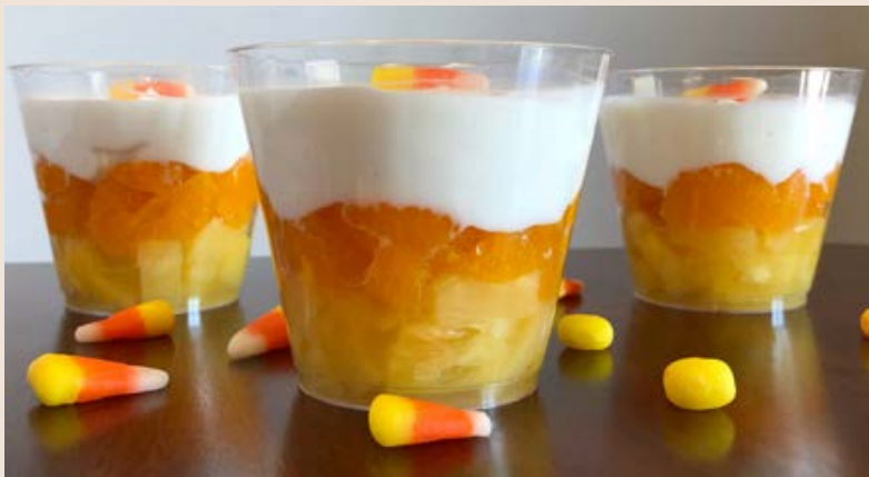
Kayla Colgrove, Nebraska Extension in Lancaster County

Nutrition Information per serving (1 parfait) – nutrition information will change if substitutions are used: Calories 157, Total Fat 0g, Saturated Fat 0g, Cholesterol 1.7mg, Sodium 37mg, Total Carbohydrate 31.5g, Dietary Fiber 1.3g, Sugars 24.1g, Protein 7.7g