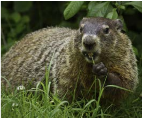
Shenandoah National Park

Groundhogs ( Marmota monax ), also known as woodchucks, can be sighted throughout the eastern half of Nebraska. Groundhogs are brownish with a grizzled appearance, reaching a length of 16–20 inches and an average weight of 7–10 pounds. The groundhog has a short, wide head, very small ears and a short fluffy tail. This short-legged, heavy-bodied animal is sometimes referred to as a land beaver. Actually, the woodchuck is closely related to the ground squirrel. Groundhogs typically live in burrows at the edges of woodlands rather than in open grasslands. They prefer to dig their holes in slopes or banks. Groundhog burrows normally have two entrances — a main hole, identified by a large accumulation of soil around it, and