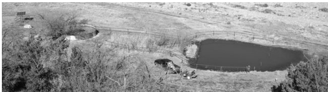
Fig. 1. Windmill- and solar-powered pump installed to retain water levels in ponds (Turner Ranch Properties, L.P.; M. Christman, US Fish and Wildlife Service, Albuquerque, NM; photograph: C. Kruse, Turner Enterprises, Inc.; pers. comm.).

J-M.H. secured funding and hosted the workshop. L.P.S. wrote the paper. All other authors contributed to the workshop and in some cases helped to develop the manuscript.