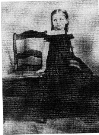
Jane Addams, age 4 Jane Addams Papers Project