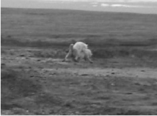
FIGURE 4. A dominant, breeding male wolf straddles a subordinate on Ellesmere Island, Nunavut, Canada during July 2009.