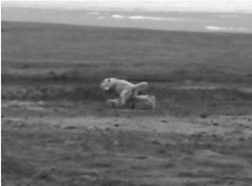
FIGURE 5. A dominant, breeding male wolf rides up on a subordinate on Ellesmere Island, Nunavut, Canada during July 2009.