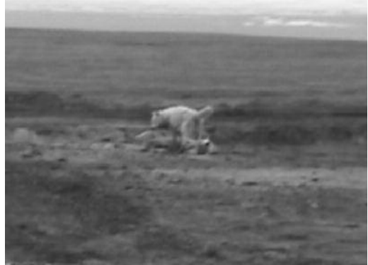
FIGURE 1. A dominant, breeding male wolf stands over a subordinate on Ellesmere Island, Nunavut, Canada during July 2009.

All of our observations of this dominating behavior by the radioed wolf were made after we had drugged and radio-tagged him. Conceivably the length, persistence, and intensity of the behavior could be related to our handling him. However, when we first observed this wolf before darting him he was dominating one of his packmates intensively. We only observed this for about 10 seconds, for our approach interrupted that activity. However we believe that that incident is strong evidence that the observation we report here