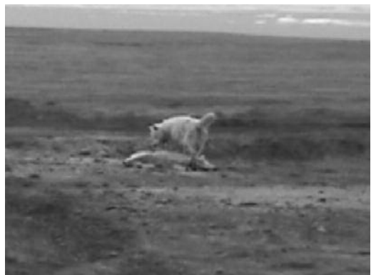
FIGURE 3. A dominant, breeding male wolf holds down a subordinate on Ellesmere Island, Nunavut, Canada during July 2009.