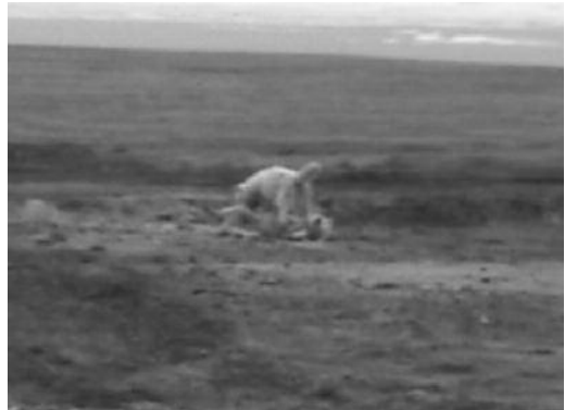
FIGURE 2. A dominant, breeding male wolf pins a subordinate on Ellesmere Island, Nunavut, Canada during July 2009.