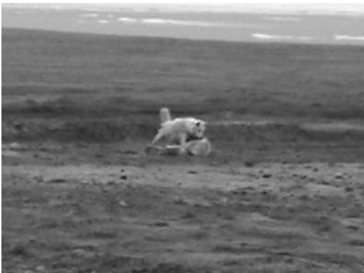
FIGURE 6. A dominant breeding male wolf forces a subordinate wolf down on Ellesmere Island, Nunavut, Canada during July 2009.

was merely a continuation of his normal behavior, not a consequence of the drugging. However, even if the behavior had been affected by the drugging, this observation still is of interest, for no one has reported such prolonged dominating under any circumstance.