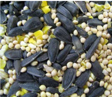
A recommended bird seed mixture consists of 50% black-oil sunflower seeds, 25% millet and 25% cracked corn.

One of the mixes recommended by specialists consists of 50% black-oil sunflower seed, 25% cracked corn and 25% white millet. Cardinals and doves will also eat safflower seed. Niger thistle seed is very attractive to finches and other small birds, but you'll need to use a special tube-shaped feeder. Small "sock feeders" filled with thistle seed are also commercially available and easy to hang. Avoid inexpensive bird seed mixes. Many of these are loaded with filler seeds like milo (sorghum). Instead of saving money, seed is wasted as birds search through the filler seed looking for seeds they prefer. Read the label on commercial bird seed packages to learn what seeds are included in the mix. Another attractive food for birds is