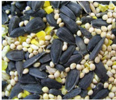
A recommended bird seed mixture consists of 50% black-oil sunflower seeds, 25% millet and 25% cracked corn.

One of the mixes recommended by specialists consists of 50% black-oil sunflower seed, 25% cracked corn and 25% white millet. Cardinals and doves will also eat safflower seed. Niger thistle seed is very attractive to finches and other small birds, but you'll need to use a special tube-shaped feeder. Small "sock feeders" filled with thistle seed are also commercially available and easy to hang.