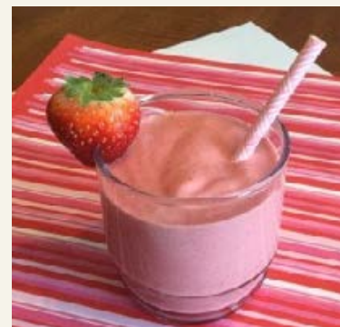
Natalie Sehi, UNL Department of Nutrition & Health Sciences

Nutrition Information: Calories 167 Total Fat 1.8g Sodium 81mg Total Carbohydrates 33g Fiber 3.1g