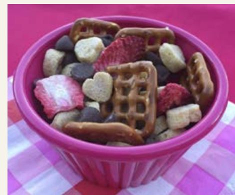
Cami Wells, Nebraska Extension in Hall County

Nutrition Information: Serving Size (1/2 cup): Calories 118 Total Fat 4g Sodium 132mg Total Carbohydrates 21g Fiber 2g