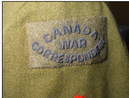
Figure 5. Shoulder Flash detail.

Shoulder Flash: The only visual icon that indicated that Holmes was not a soldier, but rather a war correspondent, was the shoulder flash that reads “Canada War Correspondent”. Made of cotton fabric, shoulder flashes were regulation wear 1½ inches below the shoulder seam, and usually indicated “Canada”. Initially only for soldiers serving overseas, these icons became a norm for all soldiers serving in the Active or Reserve Army by 1943.