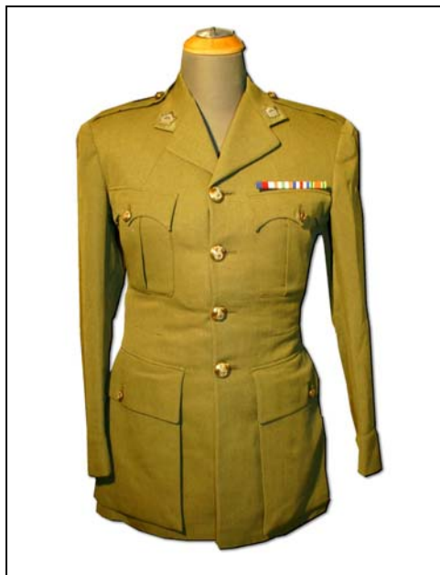
Figure 1. Art Holmes uniform, Image courtesy of CBC Museum.

War correspondents have, and continue to risk their own personal safety in order to capture a story and communicate news. The first war correspondents from the Canadian Broadcasting Corporation, Art Holmes and Robert Bowman, shipped out from Halifax in late 1939, and for the duration of the war vested themselves in standard military attire. Identical to that of the soldiers on the front whose stories they were capturing, Holmes and Bowman were given military uniforms. Although correspondents were neither soldiers nor members of the armed forces, they were given military priority and respect by association of what this uniform signified.