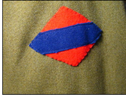
Figure 7. Patch detail.

With Betsy it seems natural that we could associate Holmes' position with the armoured division, those of tanks. However, this paper suggests that Holmes would have belonged to the infantry instead. Traditionally, the infantry were divided from the cavalry by lack of horses, as these troops proceeded on foot. "Infantry" was actually a derogatory term used by the cavalry for what they felt were lesser soldiers than themselves. The term stems from the Greek words "in" and "fans"- literally "without speaking". The cavalry were in effect calling the foot soldiers 'children'. It seems appropriate to me that Holmes lacked a horse, did not bear arms, and did not do the actual reporting or "speaking" for the correspondences he engineered. Rather, he was responsible not to speak, but rather to transmit the words of others. His own voice was never heard, but his actions had invaluable results. It was because of him that the war stories were told, even though he never spoke a word.