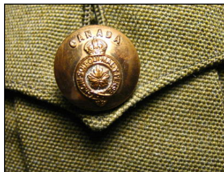
Figure 4. Button detail.

Buttons: There are ten buttons on the uniform, each bearing an identical crest. Pressed on the face of each button is a crowned loop enclosing a maple leaf with the word "CANADA" above the crown. On the circle is written " Honi soit qui mal y pense ", which is the motto of the Order of the Garter, the oldest and most important of the orders of knighthood in Great Britain. The head of the organization is the sovereign, and the garter and motto also appear on the royal coat of arms of Great Britain. This French expression can be translated as 'shamed be the person who thinks evil of it'. The story behind the saying originates in the fourteenth century, when Edward III was dancing with the Countess of Salisbury, and her garter fell off. In response to the reaction of those watching, Edward allegedly said "Honi soit qui mal y pense," and tied the garter around his own leg. The phrase later became the motto of the order, which Edward founded in 1348.