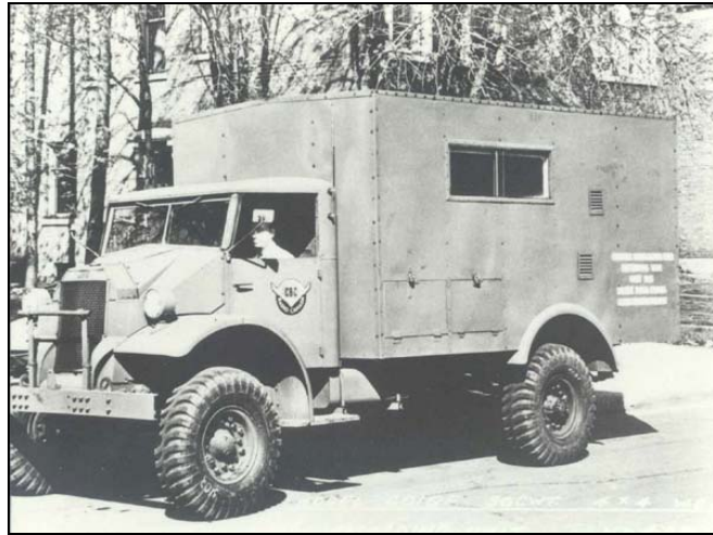
Figure 3 (right). Big Betsy.

When they began their work, Holmes realized that they would need a mobile unit for the recording equipment, and soon returned to Canada to find a van that could be equipped for their needs. He returned instead with Betsy, a four-wheel-drive army truck with three recording turntables, amplifiers, microphones and power source. She travelled thousands miles per month, and created innumerable recordings during the duration of the war.