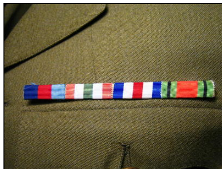
Figure 6. Ribbon bar detail.

Ribbon Bar: On everyday wear with the uniform, full medals were not worn, but a piece of the ribbon was attached to a backing to make a "ribbon bar". The medals represented on the bar, from left to right are: 1939 - 1945 Star, Italy Star, France & Germany Star, Defence Medal. The first three medals were awarded for serving during the conflict and on the Italian and North-west Europe military campaigns. The last medal was awarded for serving over 6 months in the United Kingdom.